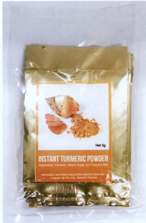
Figure 2. Unregistered AM NOBLE Instant Turmeric Powder