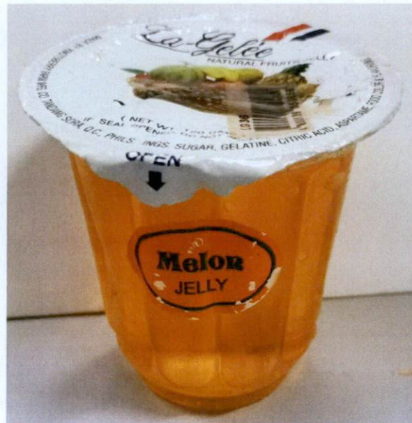
Figure 3. Unregistered LA-GELEE Natural Fruit Jelly – Melon Jelly