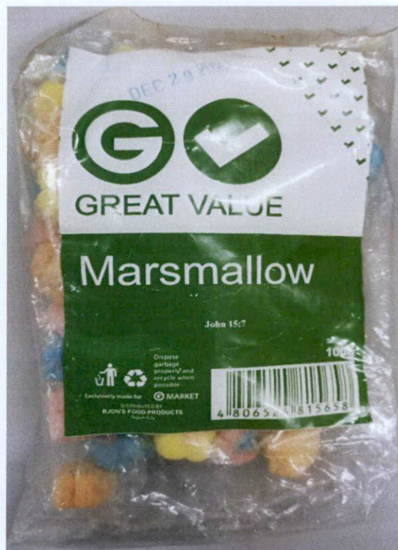
Figure 5. Unregistered GREAT VALUE Marshmallow, 100g