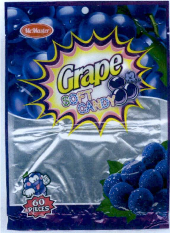
Figure 4. Unregistered MC MASTER Grape Soft Candy