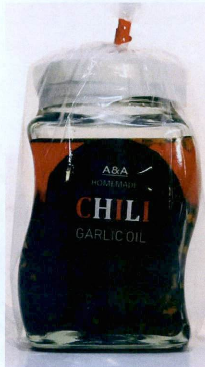
Figure 1. Unregistered A & A HOMEMADE Chili Garlic Oil

The Food and Drug Administration (FDA) warns all healthcare professionals and the general public NOT TO PURCHASE AND CONSUME the following unregistered food products: