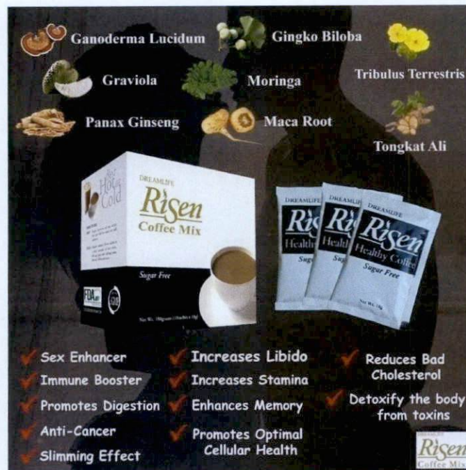
Figure 5. Unregistered DREAMLIFE Risen Coffee Mix