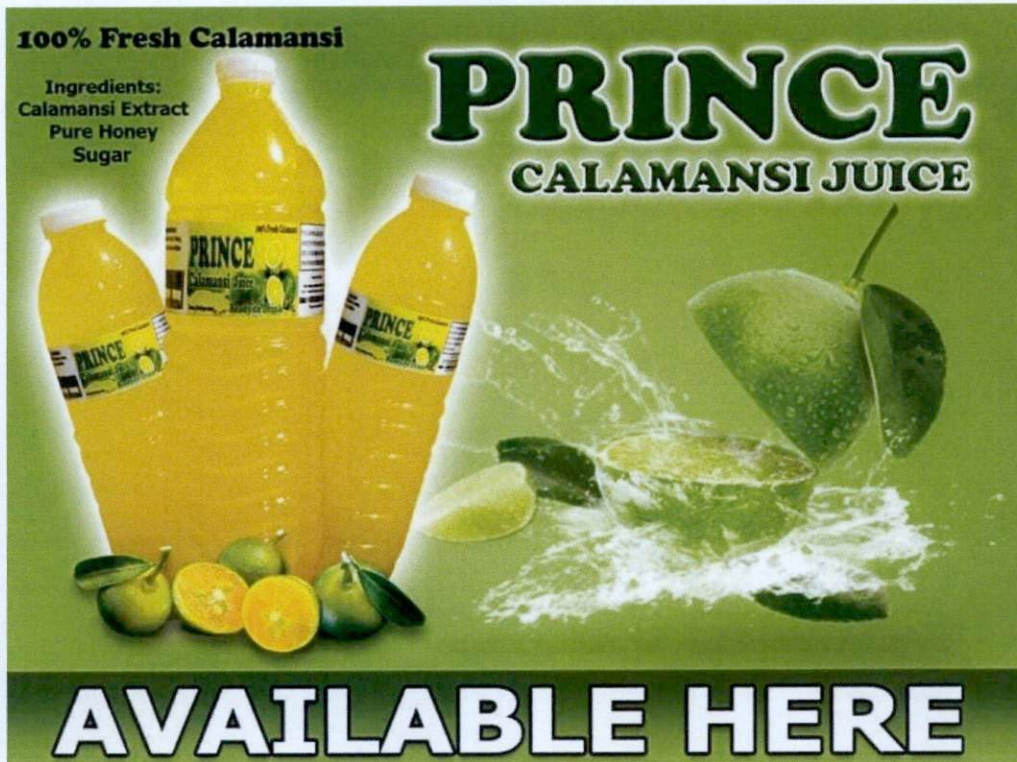
Figure 2. Unregistered PRINCE Calamansi Juice