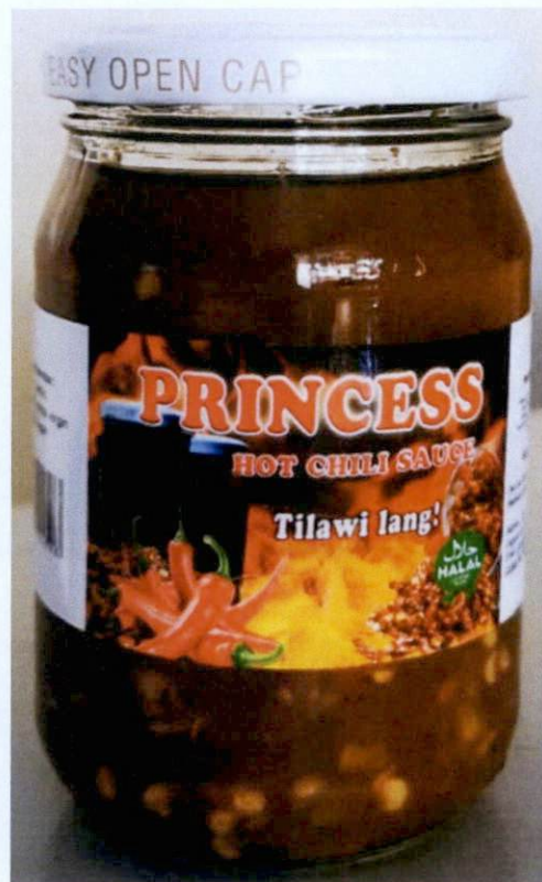
Figure 3. Unregistered PRINCESS Hot Chili Sauce