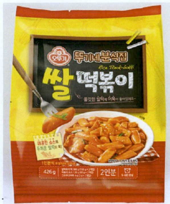
Figure 3. Unregistered OTTOGI Rice Tteokbokki (In Foreign Language)