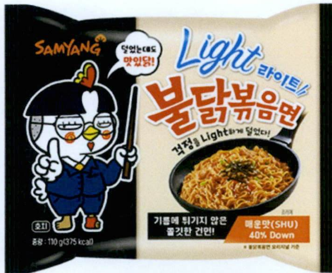
Figure 2. Unregistered SAMYANG Light Instant Noodles (In Foreign Language)