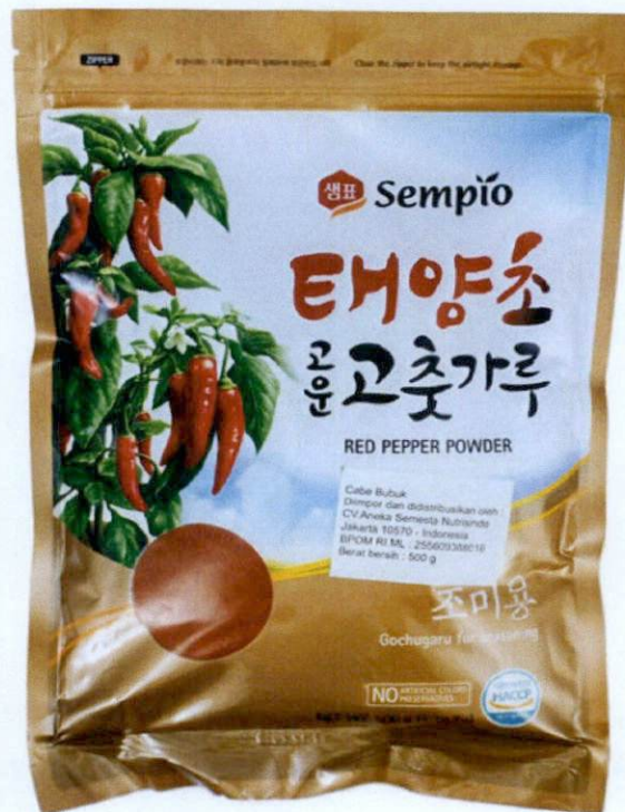
Figure 5. Unregistered SEMPIO Red Pepper Powder