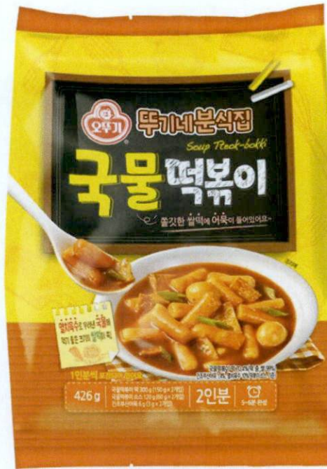
Figure 4. Unregistered OTTOGI Soup Tteok-bokki (In Foreign Language)