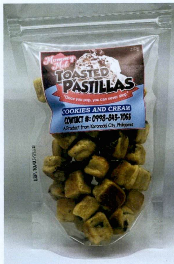
Figure 1. Unregistered MOMMY MEL Toasted Pastillas – Cookies and Cream

The Food and Drug Administration (FDA) warns all healthcare professionals and the general public NOT TO PURCHASE AND CONSUME the following unregistered food products: