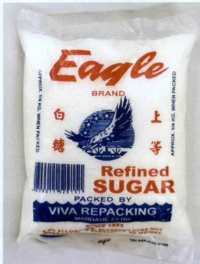
Figure 1. Unregistered EAGLE BRAND Refined Sugar

The Food and Drug Administration (FDA) warns all healthcare professionals and the general public NOT TO PURCHASE AND CONSUME the following unregistered food products: