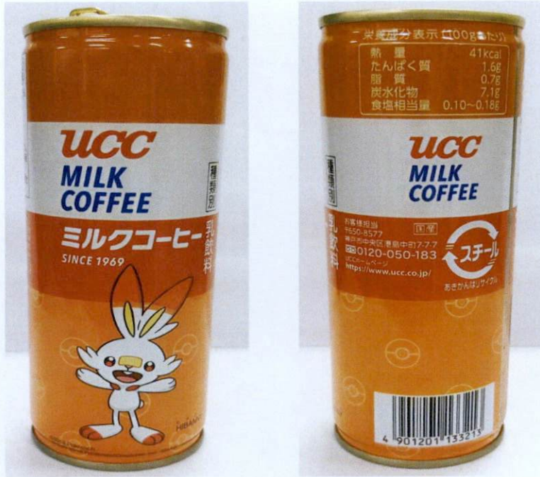
Figure 4. Unregistered UCC Milk Coffee Hibanny (In Foreign Language)