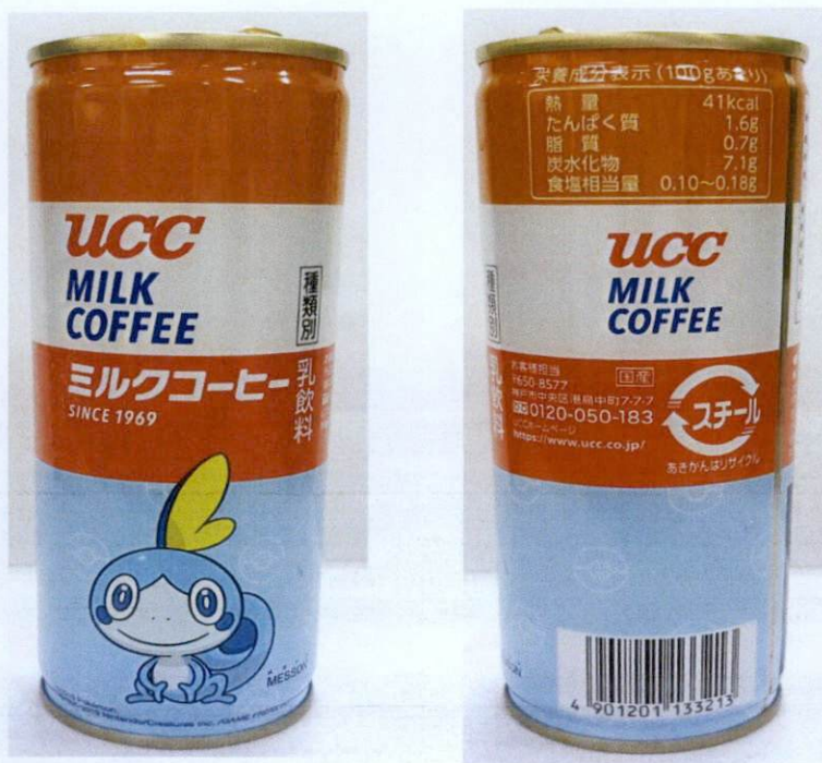
Figure 3. Unregistered UCC Milk Coffee Messon (In Foreign Language)