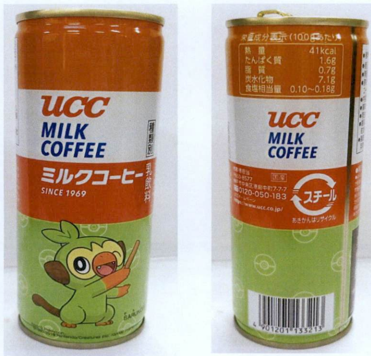
Figure 5. Unregistered UCC Milk Coffee Sarunori (In Foreign Language)