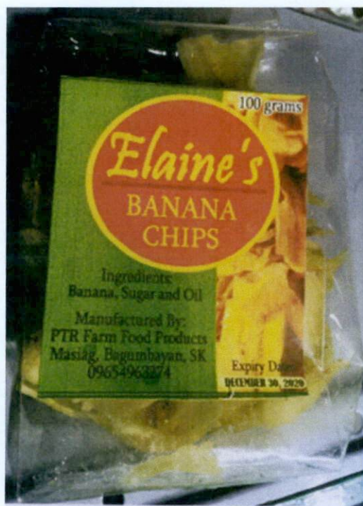
Figure 3. Unregistered ELAINE'S Banana Chips, 100g