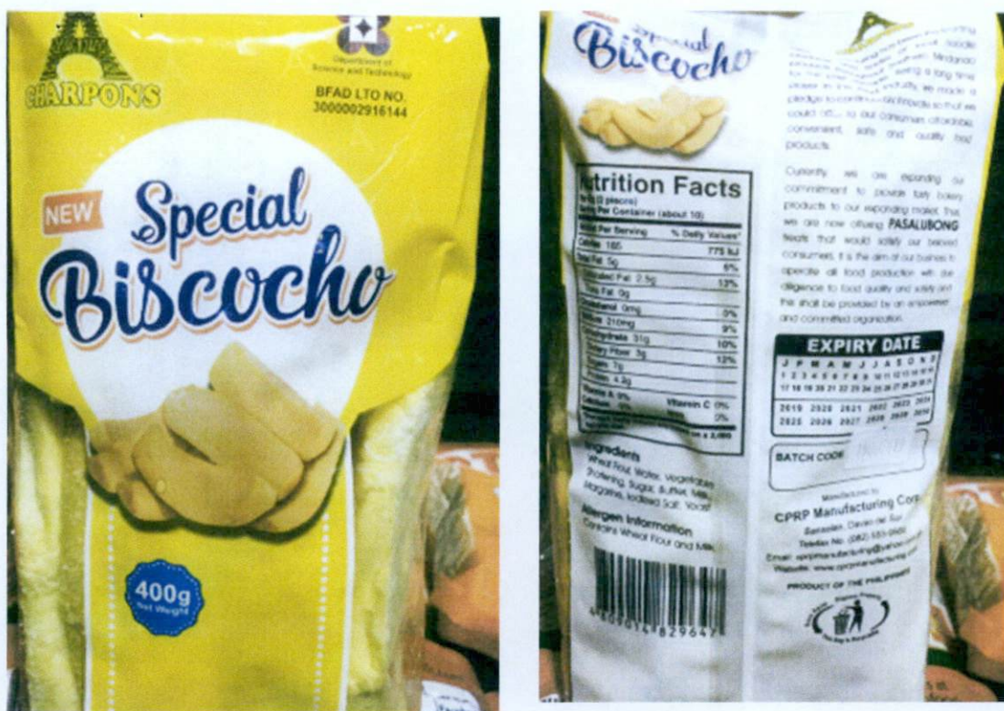
Figure 2. Unregistered TOWER CHARPONS Special Biscocho, 500g