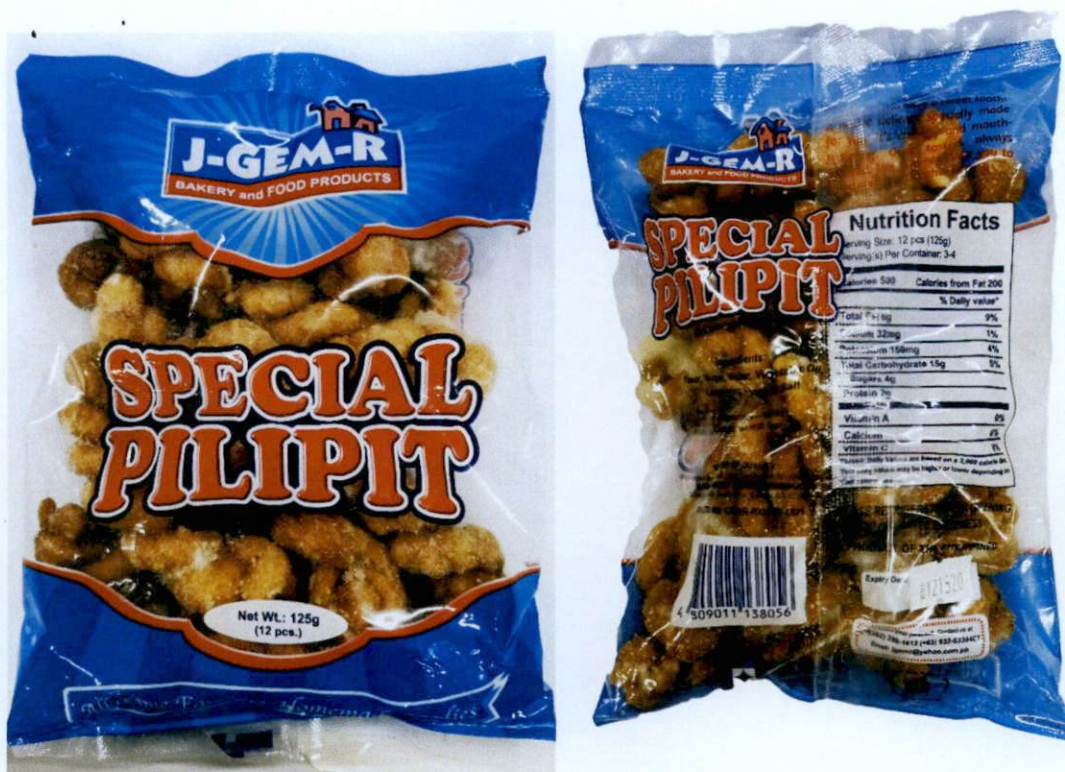
Figure 4. Unregistered J-GEM-R BAKERY AND FOOD PRODUCTS Special Pilipit, 125g