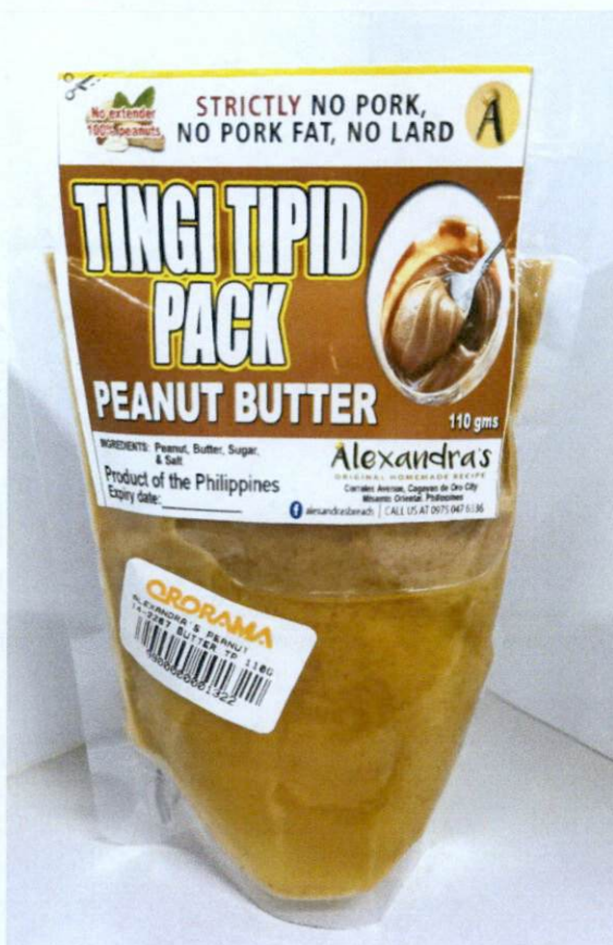
Figure 1. Unregistered ALEXANDRA'S Tingi Tipid Pack Peanut Butter, 110g

The Food and Drug Administration (FDA) warns all healthcare professionals and the general public NOT TO PURCHASE AND CONSUME the following unregistered food products: