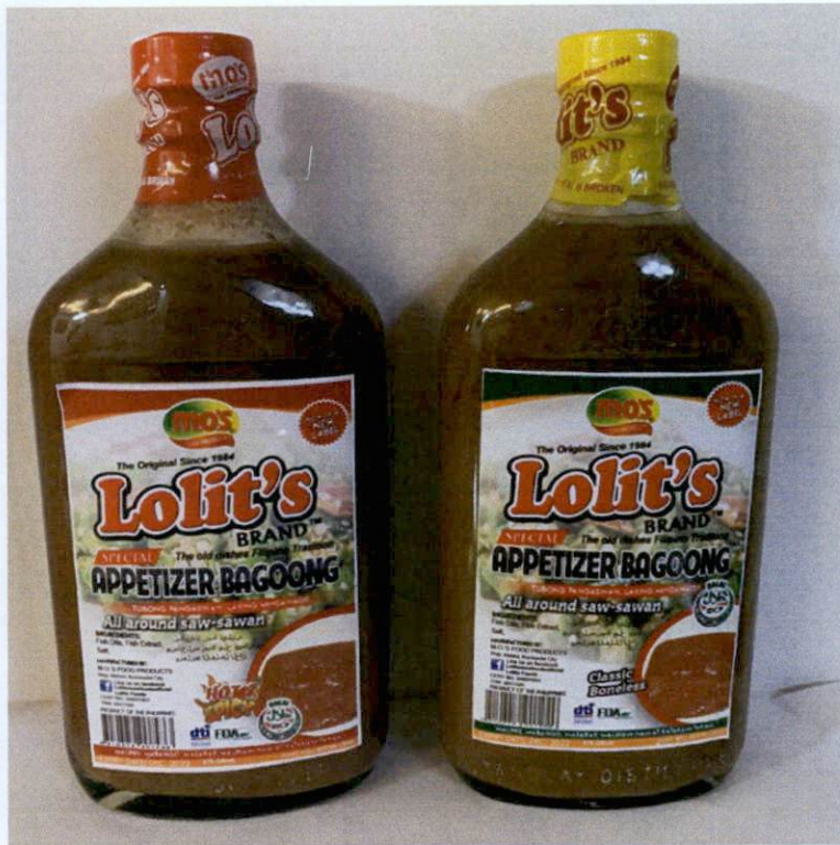
Figure 4. Unregistered LOLIT'S Appetizer Bagoong