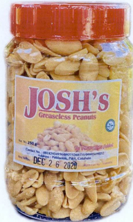
Figure 1. Unregistered JOSH'S Greaseless Peanuts

The Food and Drug Administration (FDA) warns all healthcare professionals and the general public NOT TO PURCHASE AND CONSUME the following unregistered food products: