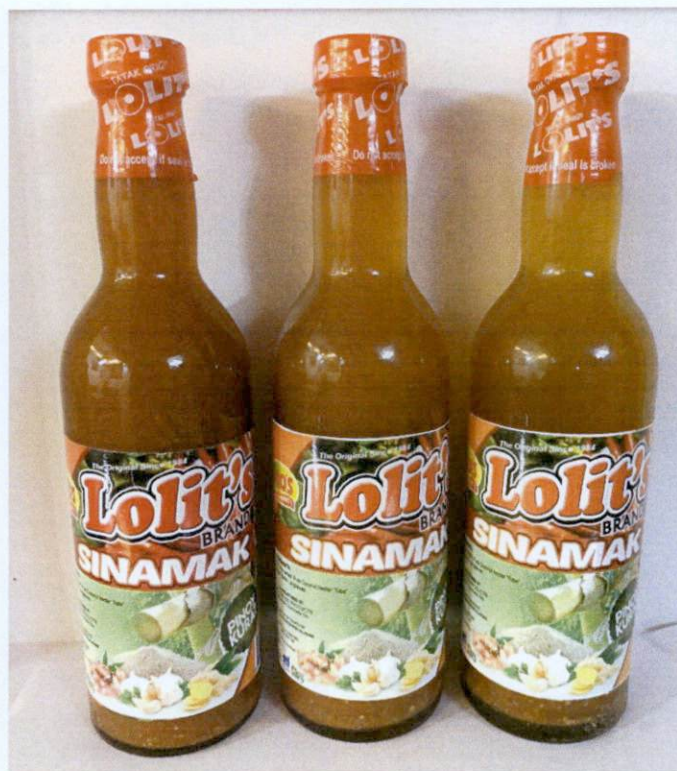
Figure 5. Unregistered LOLIT'S Sinamak