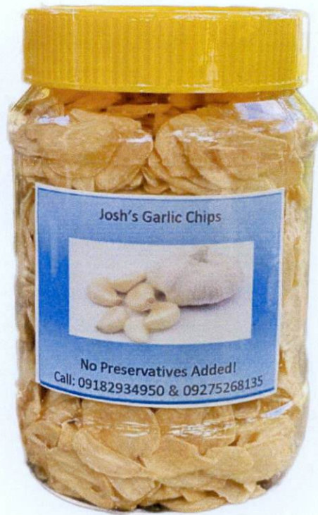
Figure 2. Unregistered JOSH'S Garlic Chips