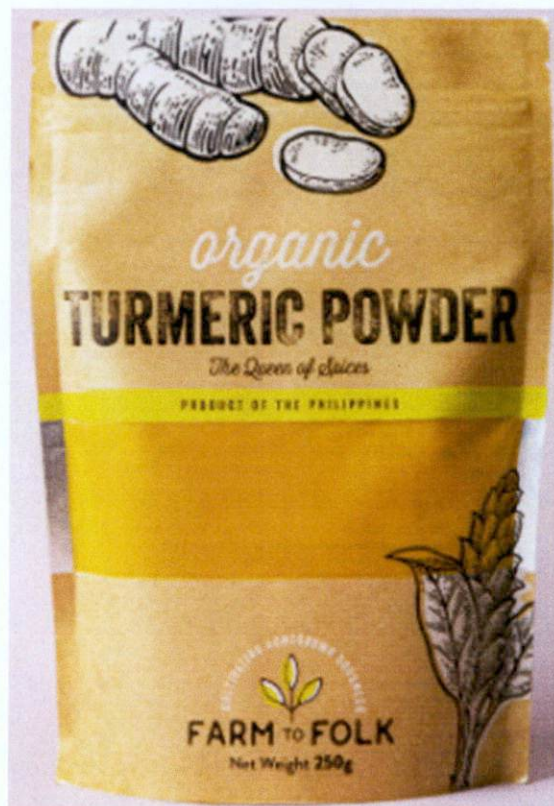
Figure 3. Unregistered FARM TO FOLK Organic Turmeric Powder