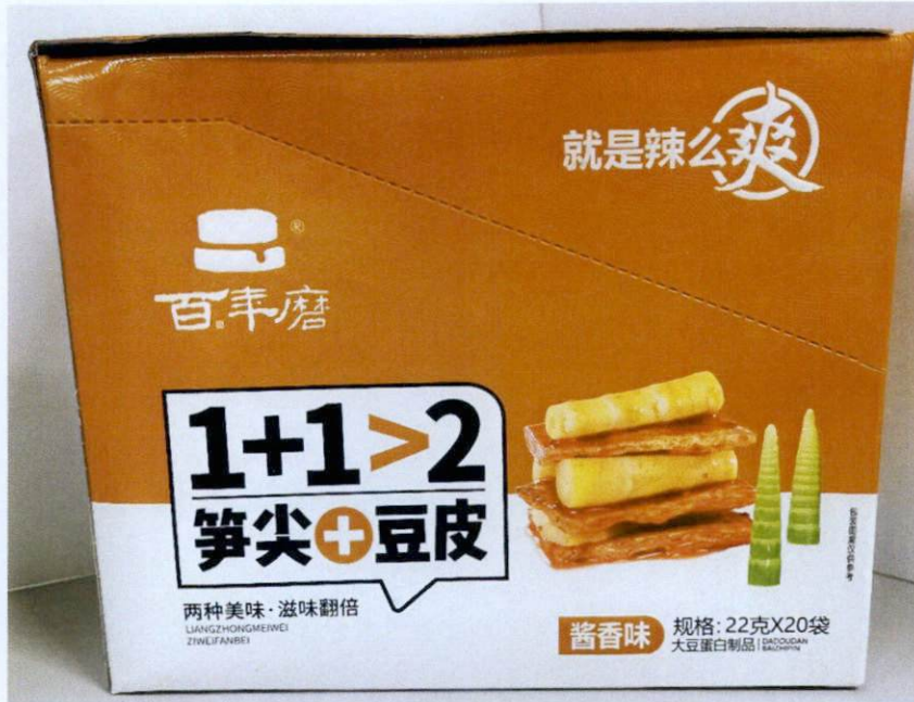
Figure 4. Unregistered LIANGZHONGMEIWEI ZIWEIFANBEI 1+1>2 with Preserved Meat and Shoot tip Image in Light Brown and White Box (In Foreign Language)