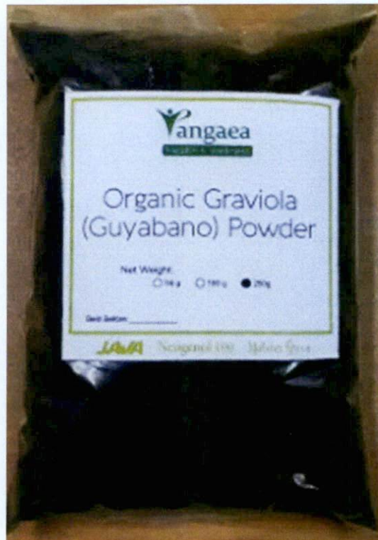
Figure 2. Unregistered PANGAEA HEALTH AND WELLNESS Organic Graviola (Guyabano) Powder