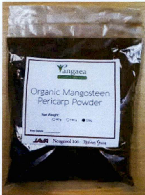
Figure 1. Unregistered PANGAEA HEALTH AND WELLNESS Organic Mangosteen Pericarp Powder

The Food and Drug Administration (FDA) warns all healthcare professionals and the general public NOT TO PURCHASE AND CONSUME the following unregistered food products: