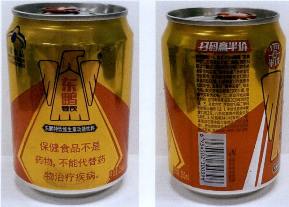
Figure 5. Unregistered Energy Drink in Gold and Red Easy Open Can (In Foreign Language)

The FDA verified through post-marketing surveillance that the above mentioned food products are not registered and no corresponding Certificates of Product Registration (CPR) have been