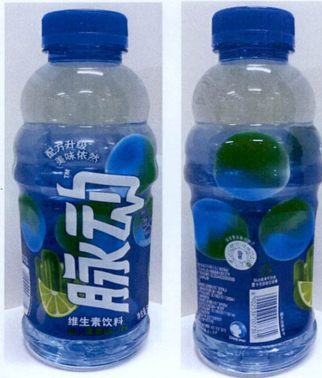
Figure 5. Unregistered LIVE ENHANCE Drink with Calamansi Image in Blue and Green PET Bottle (In Foreign Language)