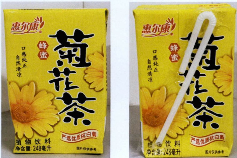
Figure 1. Unregistered Instant Drink with Sunflower Image in Yellow Tetra Brik Packaging (In Foreign Language)

The Food and Drug Administration (FDA) warns all healthcare professionals and the general public NOT TO PURCHASE AND CONSUME the following unregistered food products: