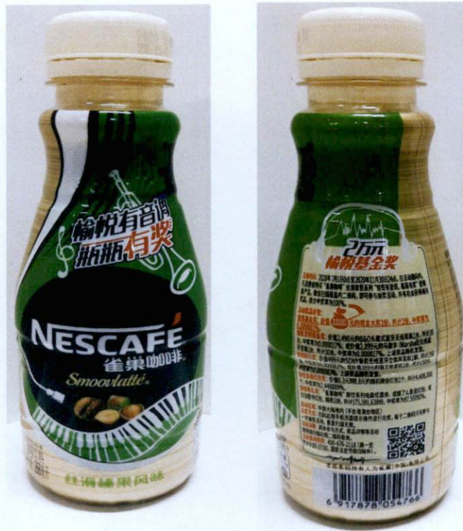
Figure 4. Unregistered NESCAFE Smoovalatte in Green and Light Brown PET Bottle (In Foreign Language)