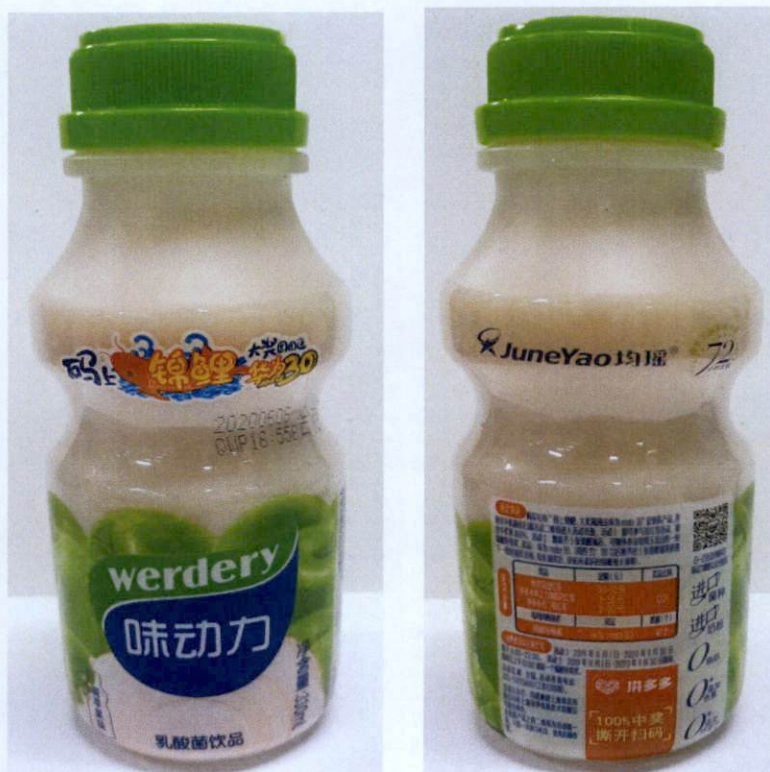
Figure 3. Unregistered WERDERY Milk Drink – Green Apple in Green and White PET Bottle (In Foreign Language)