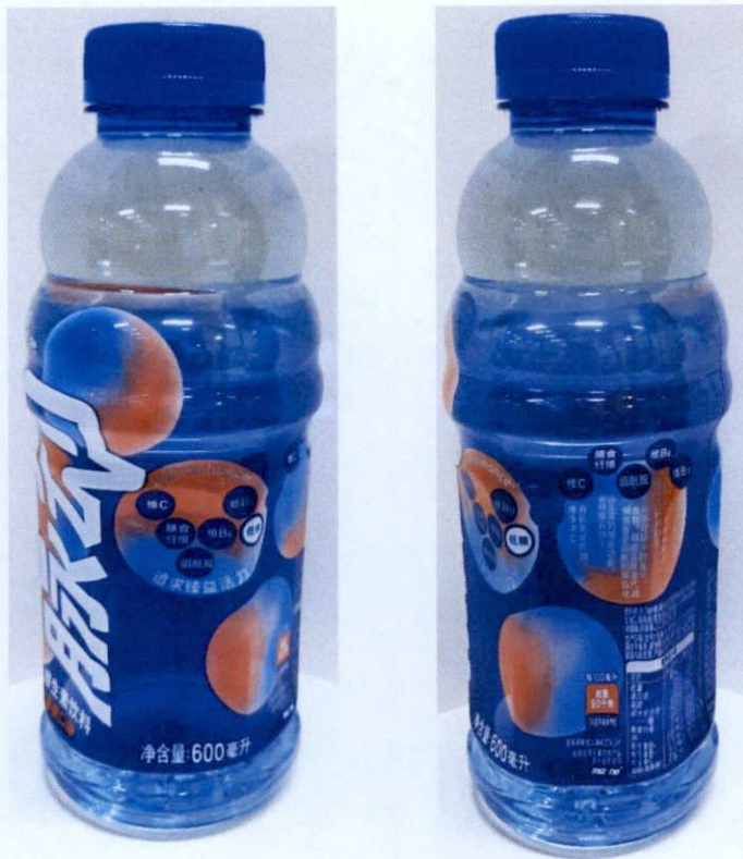
Figure 2. Unregistered LIVE ENHANCE Drink in Blue and Pink PET Bottle (In Foreign Language)