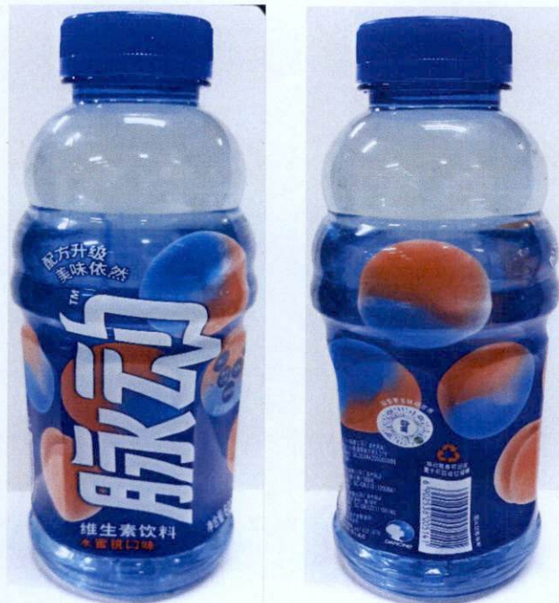
Figure 1. Unregistered LIVE ENHANCE Drink with Peach Image in Blue and Green PET Bottle (In Foreign Language)

The Food and Drug Administration (FDA) warns all healthcare professionals and the general public NOT TO PURCHASE AND CONSUME the following unregistered food products: