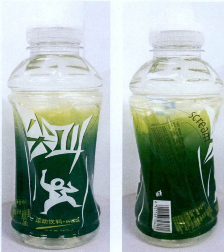
Figure 3. Unregistered SCREAM Drink in Green and White PET Bottle (In Foreign Language)