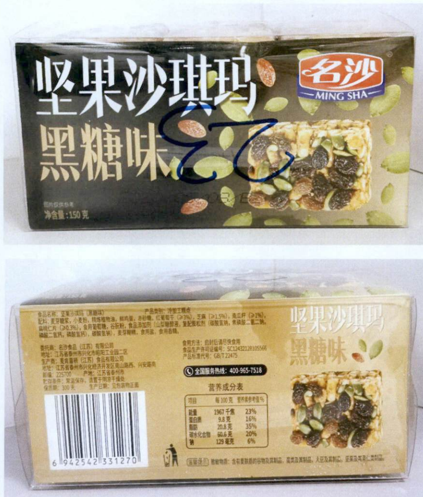
Figure 5. Unregistered MING SHA Fruit and Nut Bar in Brown and Black Box (In Foreign Language)