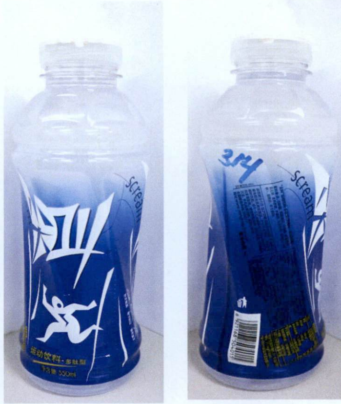
Figure 2. Unregistered SCREAM Drink in Blue and White PET Bottle (In Foreign Language)