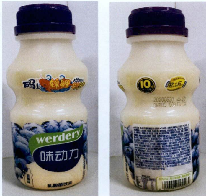
Figure 4. Unregistered WERDERLY Milk Drink – Blueberry in White and Violet PET Bottle (In Foreign Language)