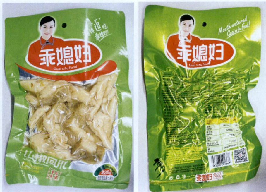
Figure 3. Unregistered GUAI XIFU FOOD Preserved Chicken Feet in Green Vacuum Sealed Packaging (In Foreign Language)