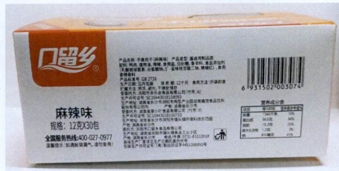
Figure 2. Unregistered Preserved Food in Clear Packaging inside a Box with Orange and Red Design (In Foreign Language)