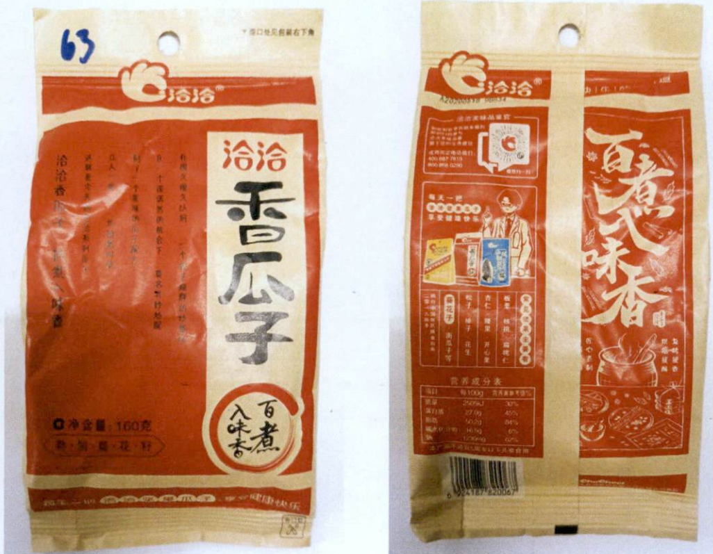
Figure 5. Unregistered CHACHEER Sunflower Seeds in Brown and Red Packaging (In Foreign Language)