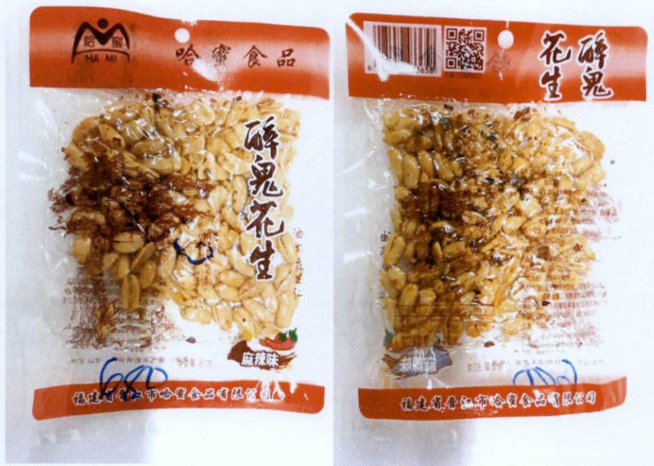
Figure 1. Unregistered HA MI Spicy Peanuts with Red Design in Clear Packaging (In Foreign Language)

The Food and Drug Administration (FDA) warns all healthcare professionals and the general public NOT TO PURCHASE AND CONSUME the following unregistered food products: