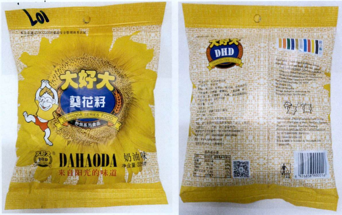
Figure 4. Unregistered DAHAODA SERIES FOOD Sunflower Seeds in Yellow and Light Brown Packaging (In Foreign Language)