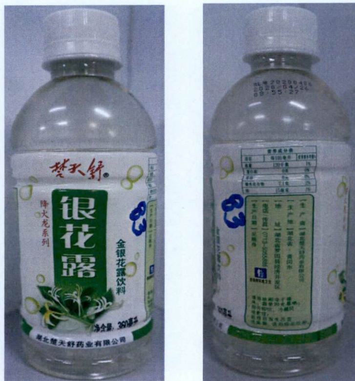
Figure 3. Unregistered CHUTIANSHU YAO YE Clear Drink in White and Green PET Bottle (In Foreign Language)