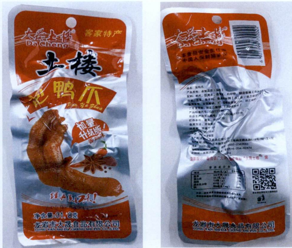
Figure 2. Unregistered DA CHENG PAO YA ZHUA Preserved Spiced Chicken Feet with Star Anise and Chili Image in Red and Silver Vacuum Sealed Packaging (In Foreign Language)