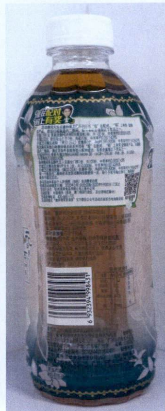
Figure 5. Unregistered Instant Tea Drink with Flower Image in PET Bottle (In Foreign Language)