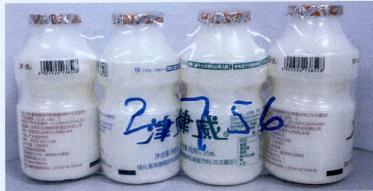
Figure 4. Unregistered Probiotic Drink, 4 bottles in 1 pack (In Foreign Language)