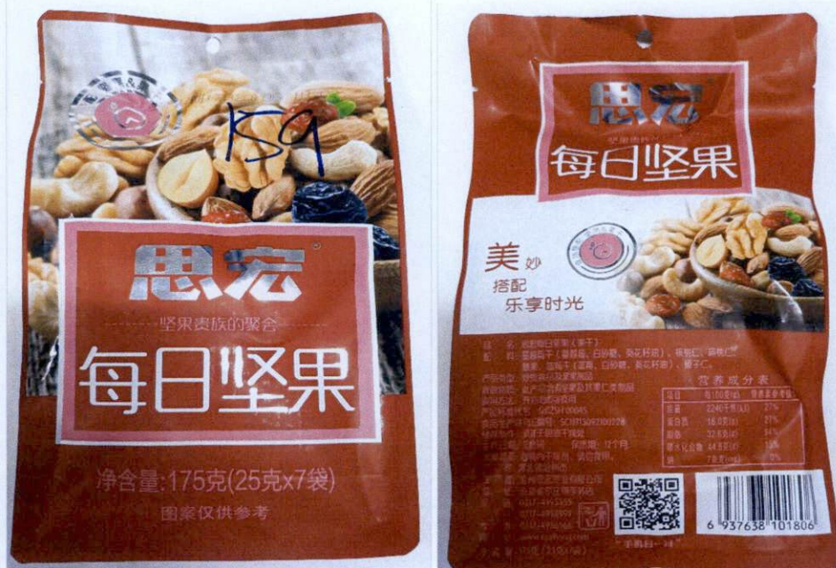
Figure 1. Unregistered Dried Fruits and Nuts in Red and Silver Packaging (In Foreign Language)

The Food and Drug Administration (FDA) warns all healthcare professionals and the general public NOT TO PURCHASE AND CONSUME the following unregistered food products: