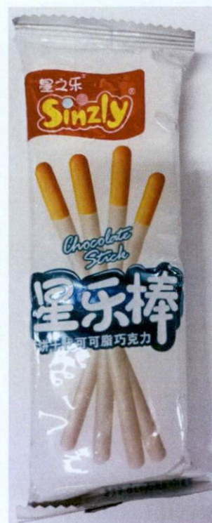
Figure 5. Unregistered SINZLY Chocolate Stick In White Foil Packaging (In Foreign Language)