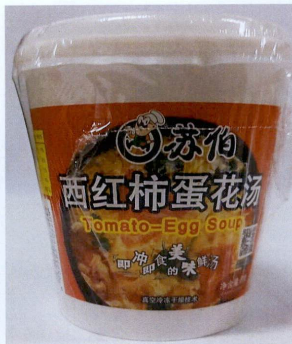
Figure 3. Unregistered Tomato-Egg Soup In Plastic Cup Packaging with Red Packaging (In Foreign Language)