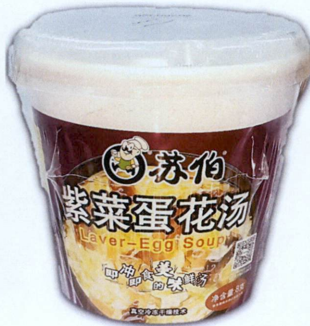
Figure 1. Unregistered Laver-Egg Soup In Plastic Cup Packaging With Violet Packaging (In Foreign Language)

The Food and Drug Administration (FDA) warns all healthcare professionals and the general public NOT TO PURCHASE AND CONSUME the following unregistered food products: