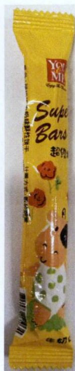
Figure 4. Unregistered YOU & ME Super Bars in Yellow Foil Pack Packaging (In Foreign Language)