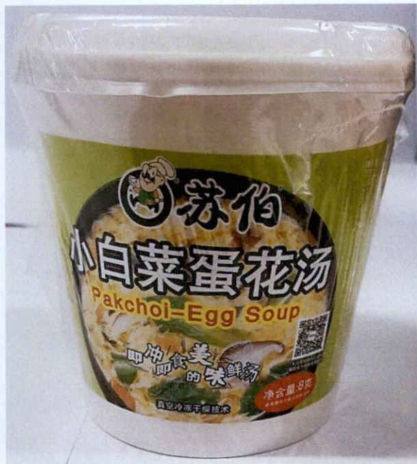
Figure 2. Unregistered Pakchoi-Egg Soup In Plastic Cup Packaging With Green Packaging (In Foreign Language)