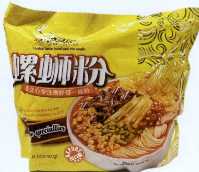
Figure 1. Unregistered HAOHUANLUO Liuzhou Snail Rice Noodles Instant Noodles in Foil Pouch with Yellow Packaging 400g (In Foreign Language)

The Food and Drug Administration (FDA) warns all healthcare professionals and the general public NOT TO PURCHASE AND CONSUME the following unregistered food products: