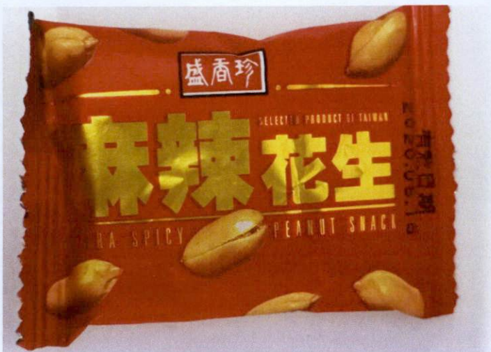
Figure 4. Unregistered Ultra Spicy Peanut Snack in Red Foil Packaging (In Foreign Language)