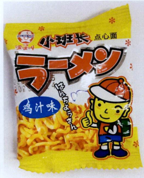
Figure 3. Unregistered HSIA HSIA CHAIO Noodle Snack in Yellow Foil Packaging (In Foreign Language)