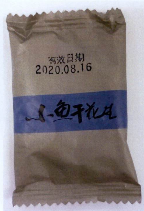
Figure 5. Unregistered Food Product in Gray and Blue Foil Packaging (In Foreign Language)