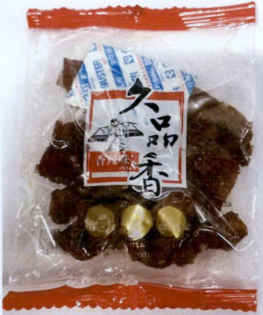
Figure 2. Unregistered Meat like Product in Clear Plastic Sachet Packaging (In Foreign Language)