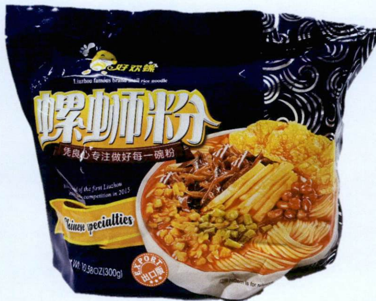
Figure 1. Unregistered HAOHUANLUO Liuzhou Snail Rice Noodles Instant Noodles in Foil Pouch with Violet Packaging 300g (In Foreign Language)

The Food and Drug Administration (FDA) warns all healthcare professionals and the general public NOT TO PURCHASE AND CONSUME the following unregistered food products: