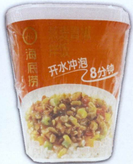
Figure 3. Unregistered HI Rice Meal Cup Orange Packaging (In Foreign Language)