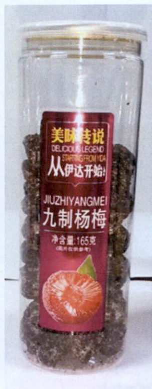
Figure 4. Unregistered DELICIOUS LEGEND STARTING FROM YIDA JIUZHIYANGMEI (In Foreign Language)