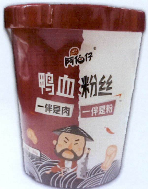
Figure 5. Unregistered Cup Noodles Purple and White Packaging 180g (In Foreign Language)