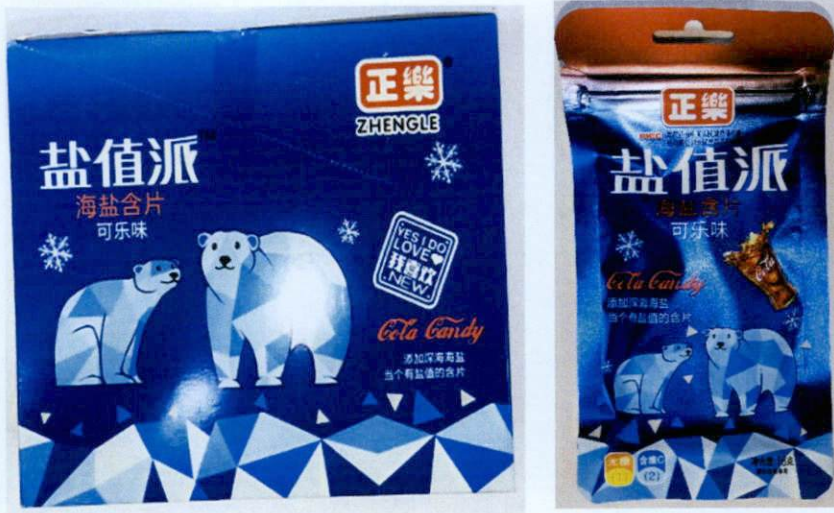
Figure 2. Unregistered ZHENGLÉ Cola Candy with Foil Pouch Packaging Inside Carton Box (In Foreign Language)