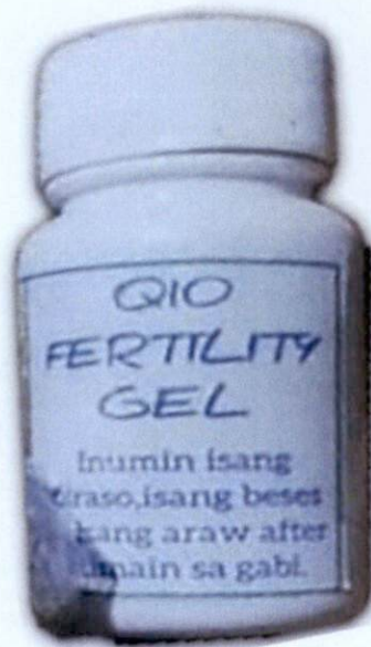
Figure 1. Unregistered Cup Noodles Red and White Packaging 180g (In Foreign Language)

The Food and Drug Administration (FDA) warns all healthcare professionals and the general public NOT TO PURCHASE AND CONSUME the following unregistered food supplement and food products: