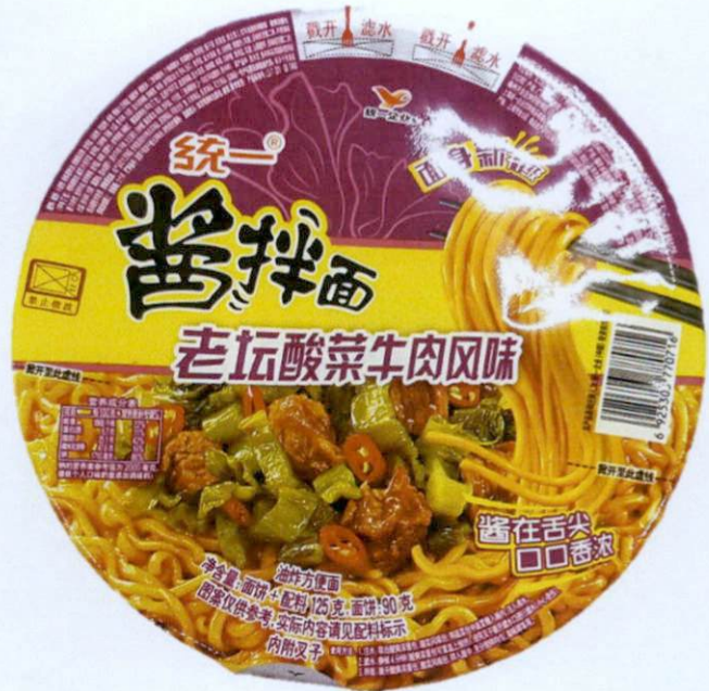
Figure 3. Unregistered Instant Noodles in Plastic Bowl with Violet and Gold Packaging (In Foreign Language)