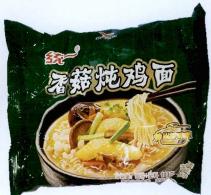
Figure 5. Unregistered Instant Noodles Green Pouch Packaging (In Foreign Language)