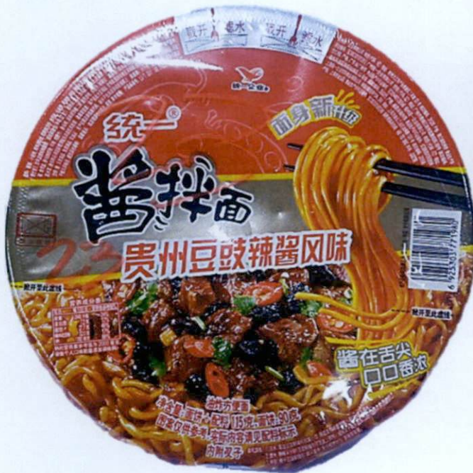
Figure 4. Unregistered Instant Noodles in Plastic Bowl with Red and Gold Packaging (In Foreign Language)