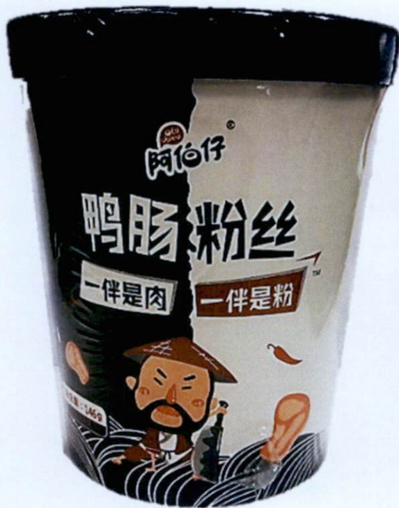
Figure 2. Unregistered Cup Noodles Black and White Packaging 180g (In Foreign Language)