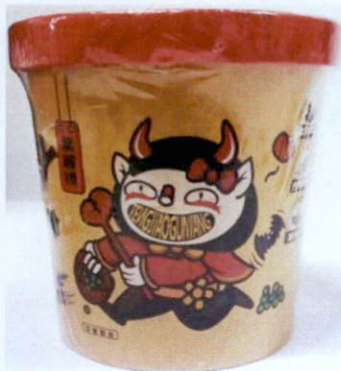
Figure 4. Unregistered ENERGY Tengjiaoguniang Cup Noodles in Pink and Brown Packaging (In Foreign Language)