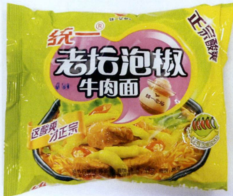
Figure 1. Unregistered Instant Noodles Yellow and Green Pouch Packaging (In Foreign Language)

The Food and Drug Administration (FDA) warns all healthcare professionals and the general public NOT TO PURCHASE AND CONSUME the following unregistered food products: