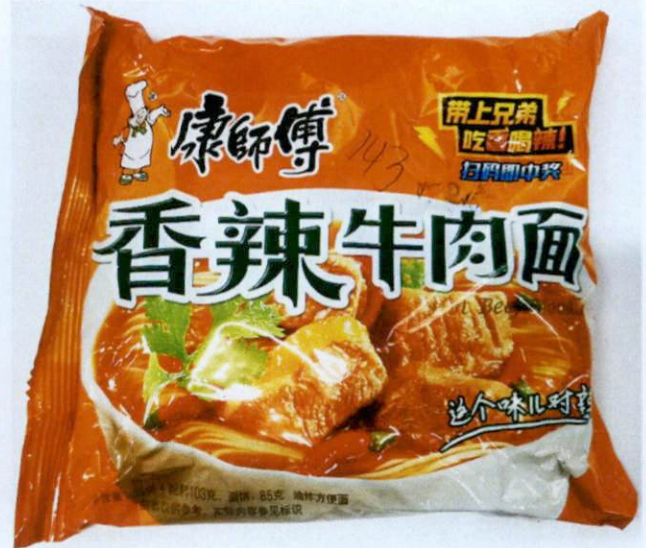
Figure 3. Unregistered Instant Noodles Hot Beef Flavor Orange Pouch Packaging (In Foreign Language)