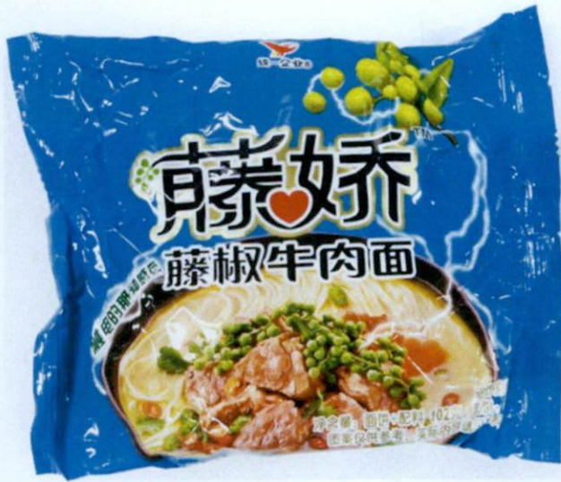
Figure 2. Unregistered Instant Noodles in Bluegreen Pouch Packaging (In Foreign Language)