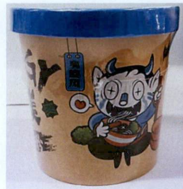
Figure 5. Unregistered ENERGY Cup Noodles in Blue and Brown Packaging (In Foreign Language)