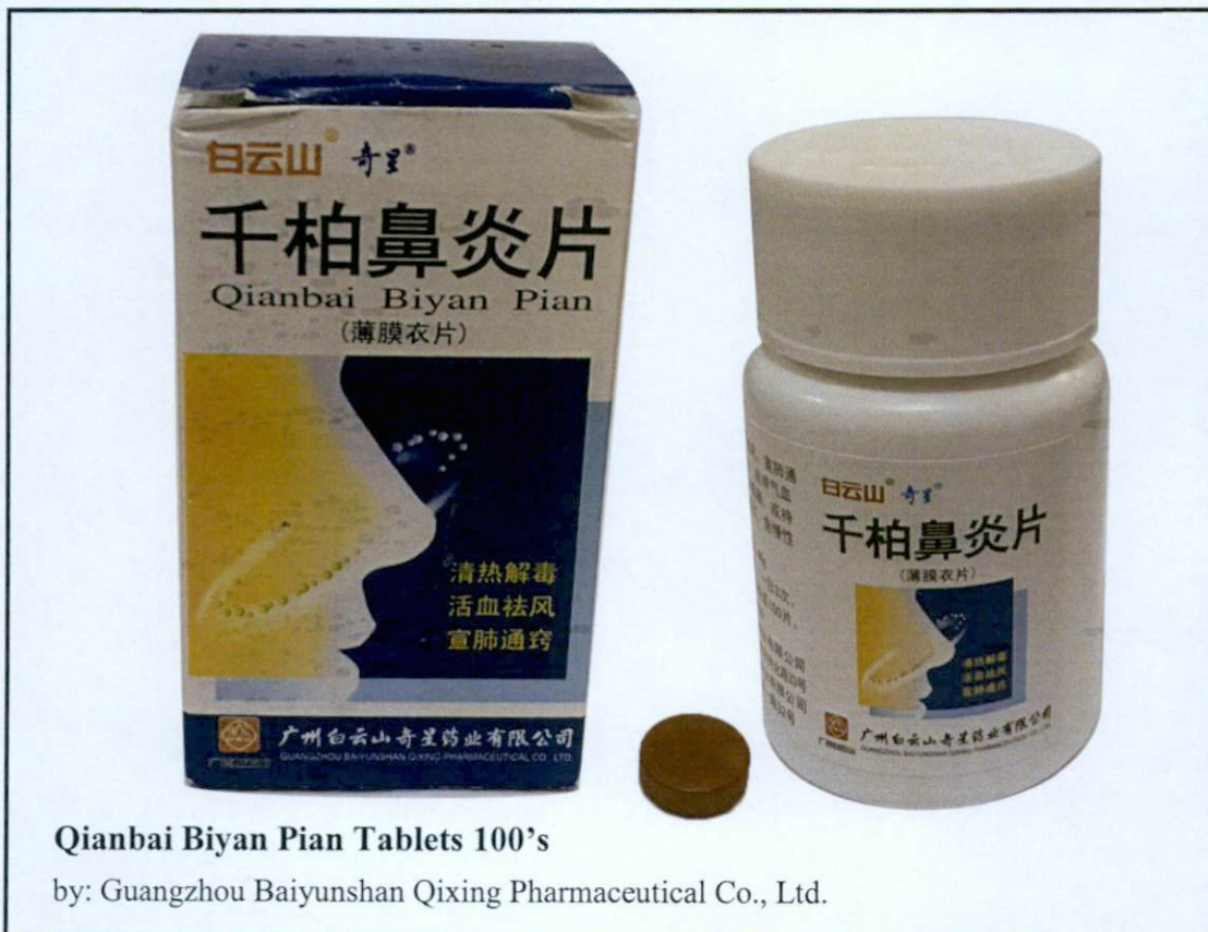
Figure 3. Unregistered drug product