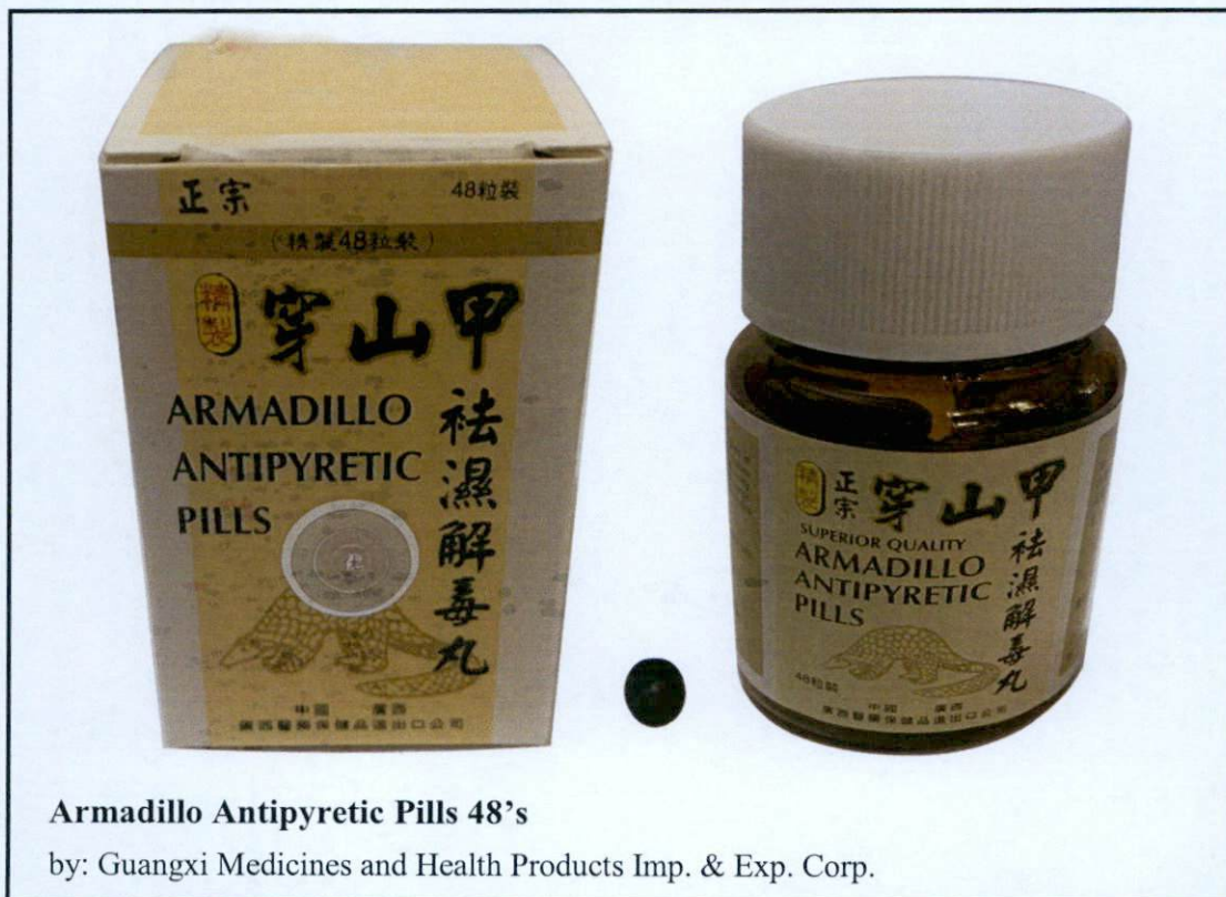
Figure 1. Unregistered drug product

The Food and Drug Administration (FDA) advises the public against the purchase and use of the following unregistered drug products: