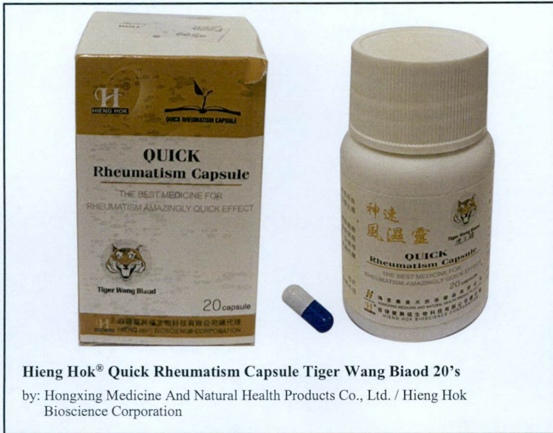
Figure 2. Unregistered drug product