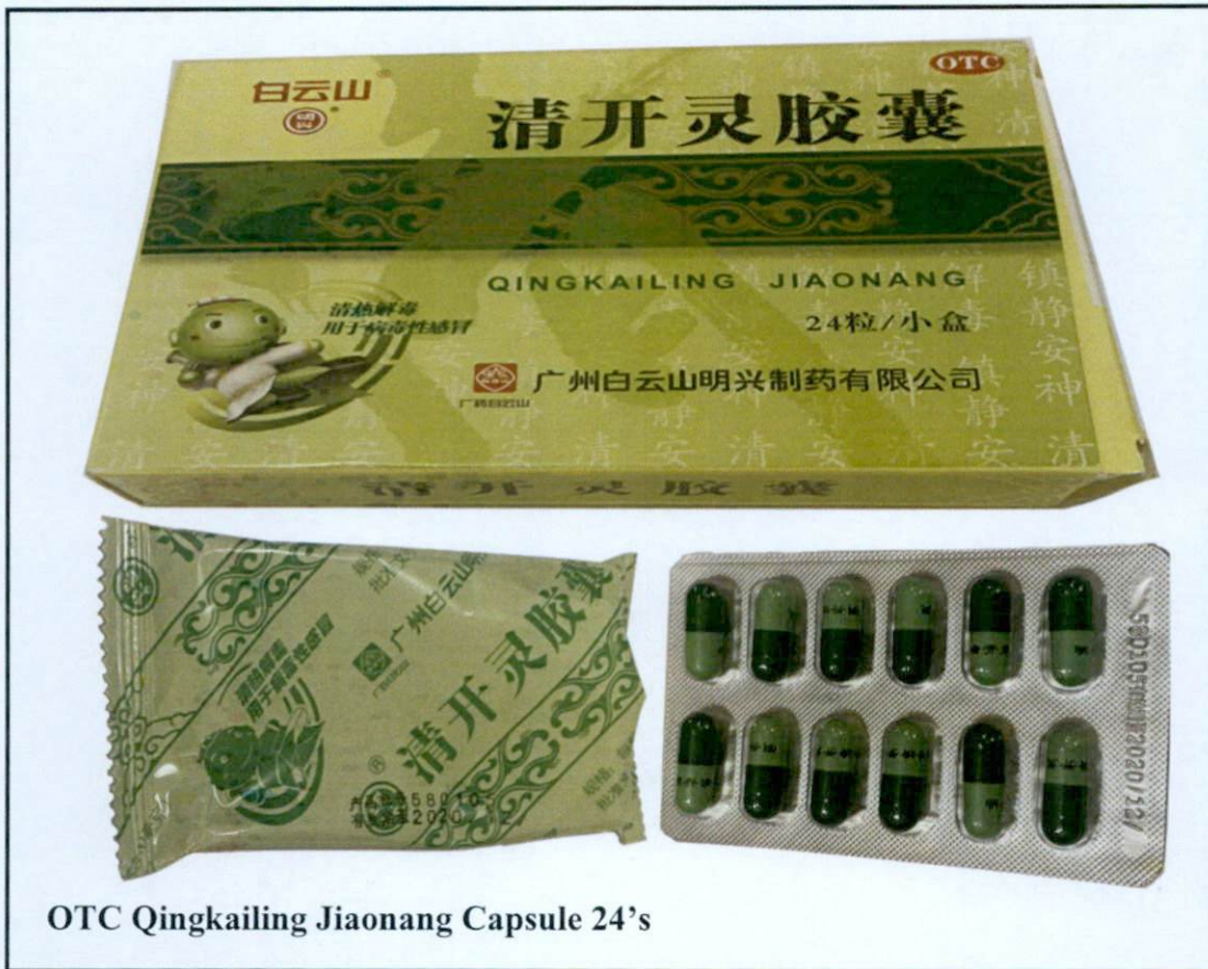
OTC Qingkailing Jiaonang Capsule 24's