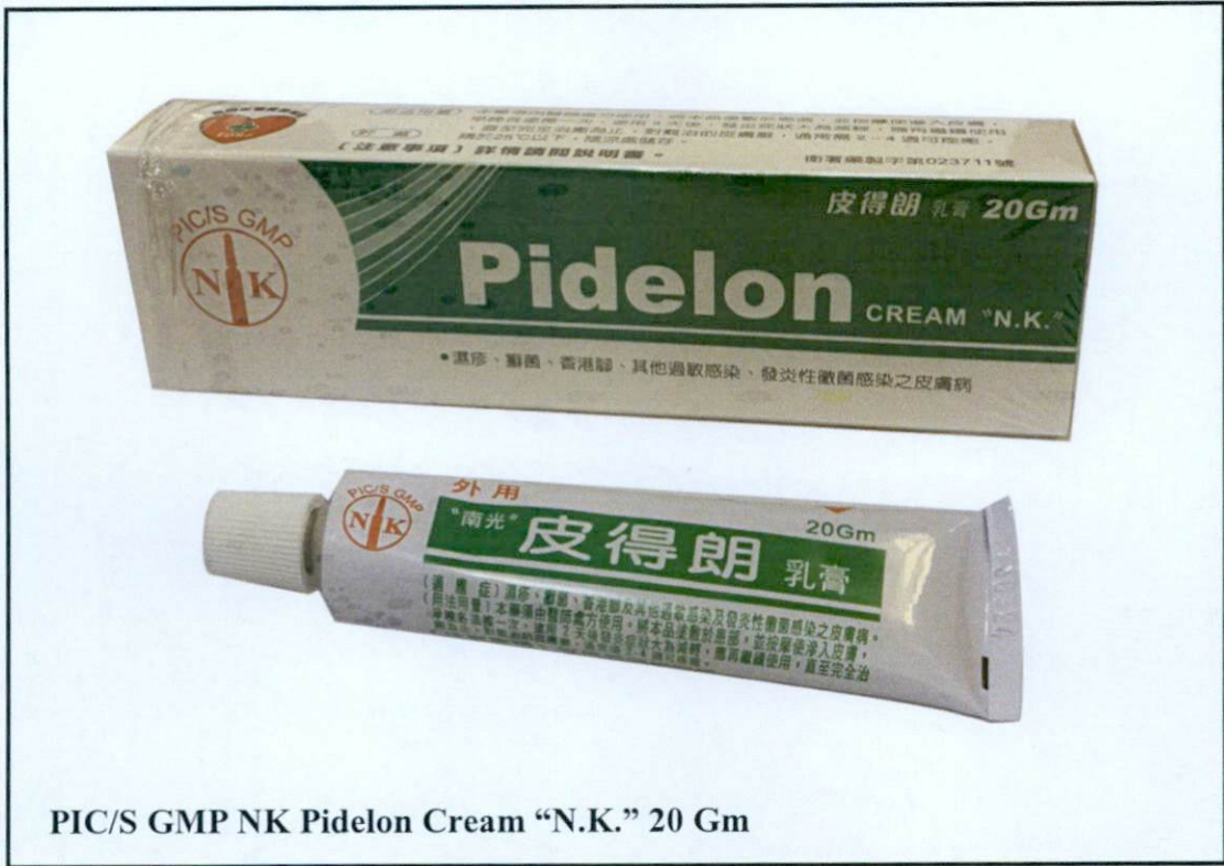
PIC/S GMP NK Pidelon Cream "N.K." 20 Gm