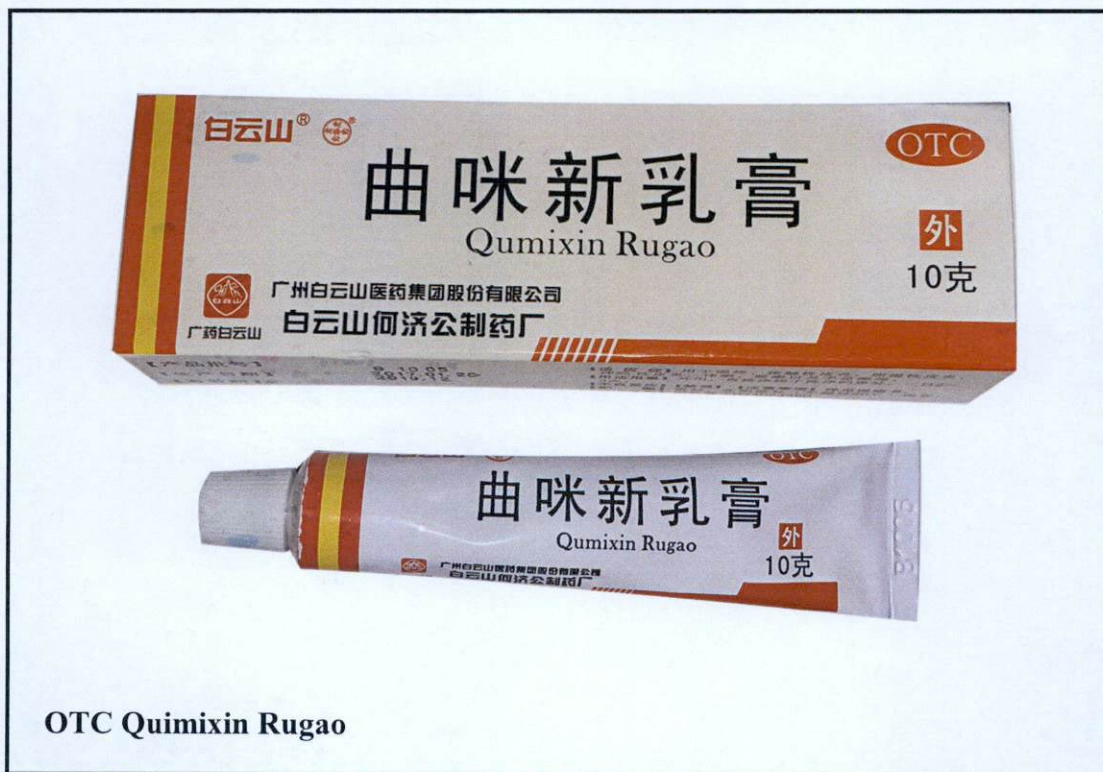
OTC Qumixin Rugao

The Food and Drug Administration (FDA) advises the public against the purchase and use of the following unregistered drug products: