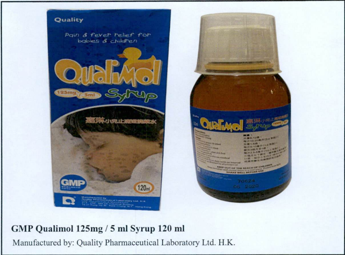
GMP Qualimol 125mg / 5 ml Syrup 120 ml Manufactured by: Quality Pharmaceutical Laboratory Ltd. H.K.