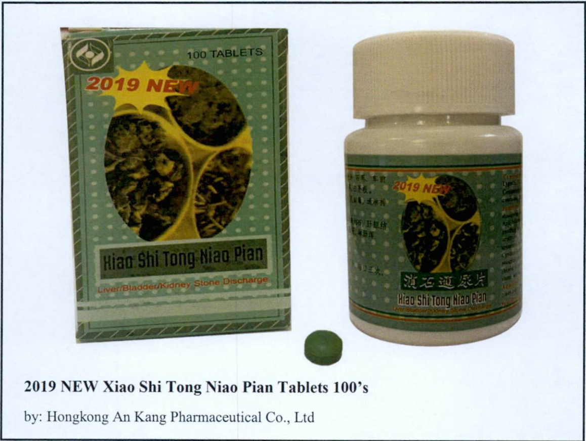
2019 NEW Xiao Shi Tong Niao Pian Tablets 100's by: Hongkong An Kang Pharmaceutical Co., Ltd