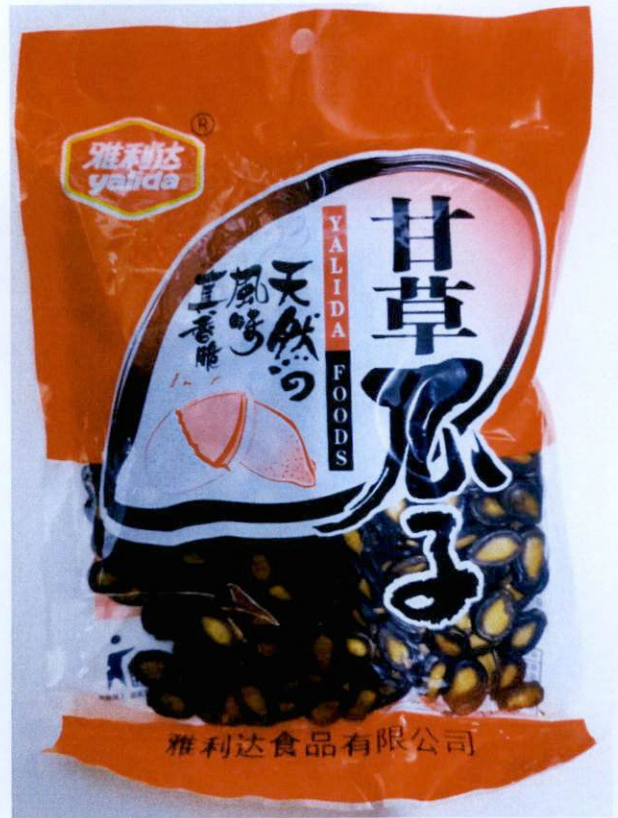
Figure 3. Unregistered YALIDA Watermelon Seeds with Red Packaging