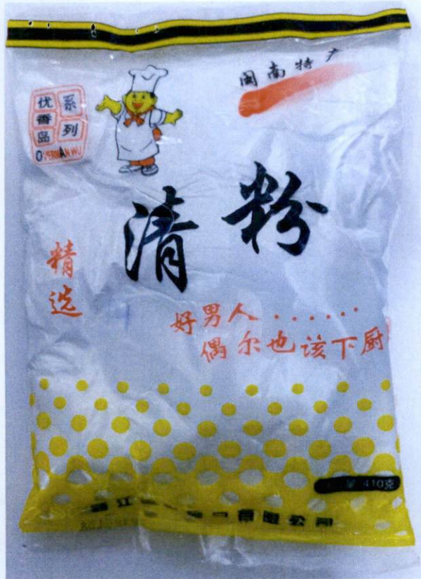
Figure 2. Unregistered OVERMANWU with Yellow/Black Colored Packaging