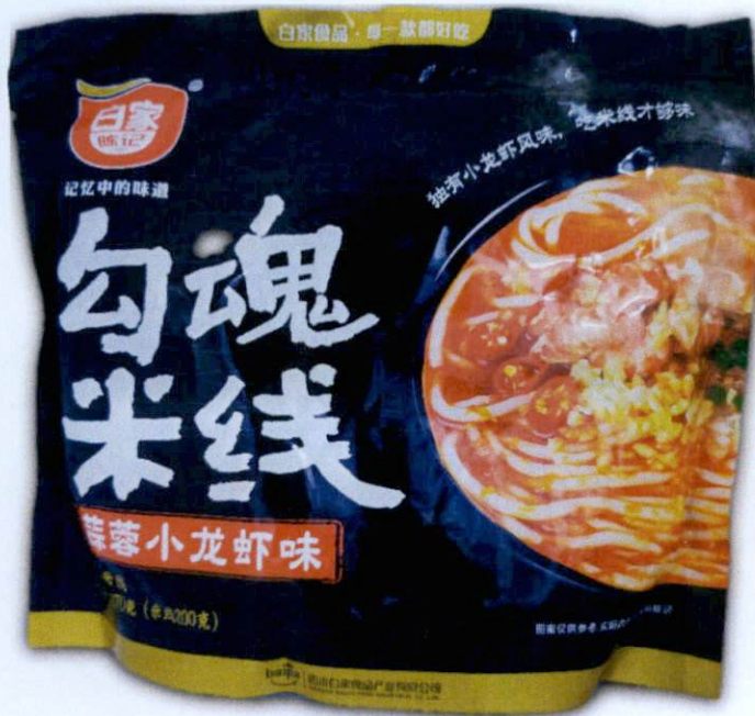
Figure 4. Unregistered Noodles with Black Packaging