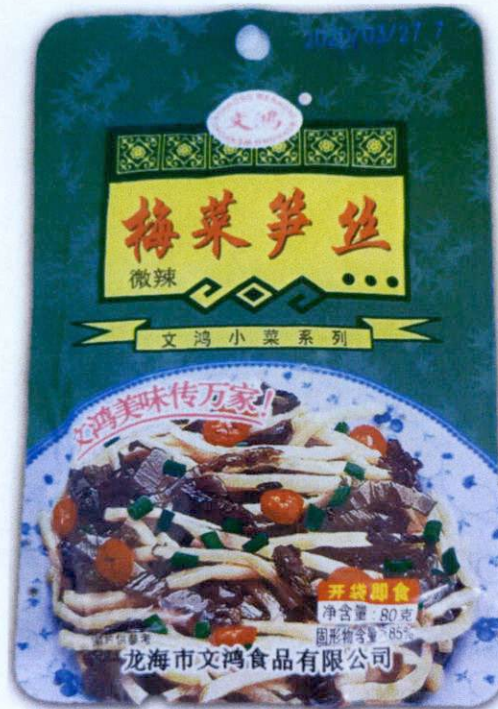
Figure 1. Unregistered WENCHONG Green Pack Color with Meat and Noodles Picture

The Food and Drug Administration (FDA) warns all healthcare professionals and the general public NOT TO PURCHASE AND CONSUME the following unregistered food products: