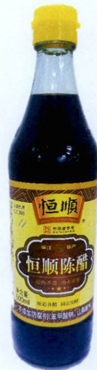
Figure 5. Unregistered Glass Bottle with Yellow Plastic Cup