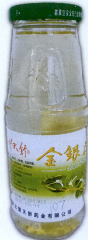
Figure 5. Unregistered Juice Drink 340 ml Green Cap (In Foreign Language)