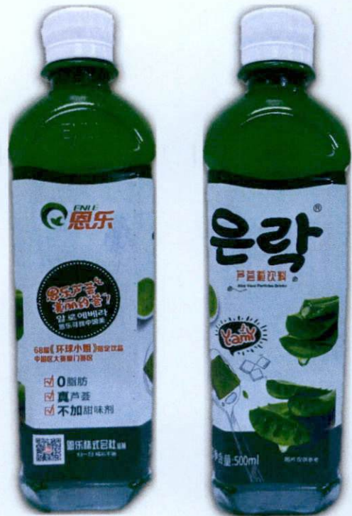
Figure 3. Unregistered Enle 500ml Green Bottle with Aloe Vera Picture (In Foreign Language)