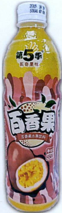
Figure 2. Unregistered Juice Drink with Picture of Pomegranate Packaging Pink in Color (In Foreign Language)