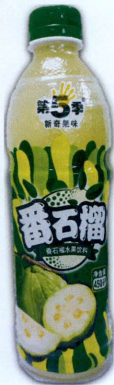
Figure 4. Unregistered Bottled Juice Drink with Picture of Guava (In Foreign Language)