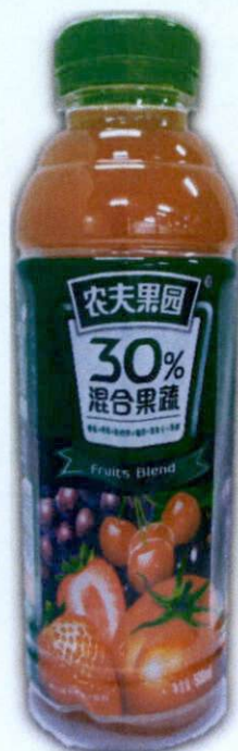
Figure 1. Unregistered Fruits Blend 30% 500ml Juice with Picture of Fruits (In Foreign Language)

The Food and Drug Administration (FDA) warns all healthcare professionals and the general public NOT TO PURCHASE AND CONSUME the following unregistered food products: