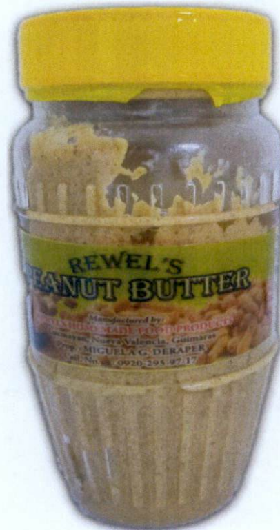
Figure 1. Unregistered REWEL'S Peanut Butter

The Food and Drug Administration (FDA) warns all healthcare professionals and the general public NOT TO PURCHASE AND CONSUME the following unregistered food products: