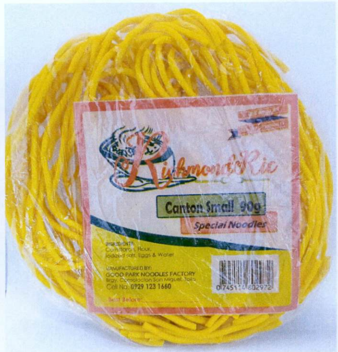
Figure 3. Unregistered RICHMOND RIC Canton Small