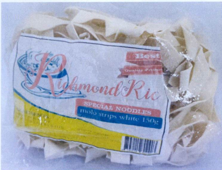
Figure 4. Unregistered RICHMOND RIC Special Noodles Molo Strips White