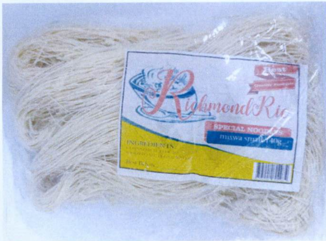
Figure 2. Unregistered RICHMOND RIC Miswa Small