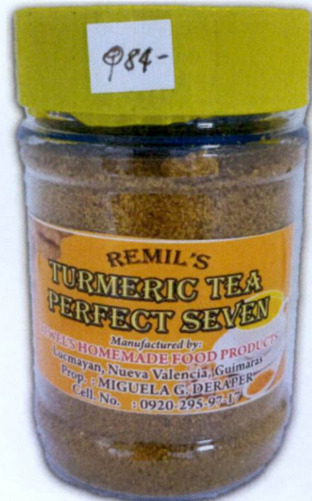
Figure 5. Unregistered REMIL'S Turmeric Tea Perfect Seven