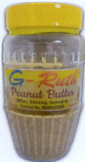
Figure 4. Unregistered G-RUTH Peanut Butter