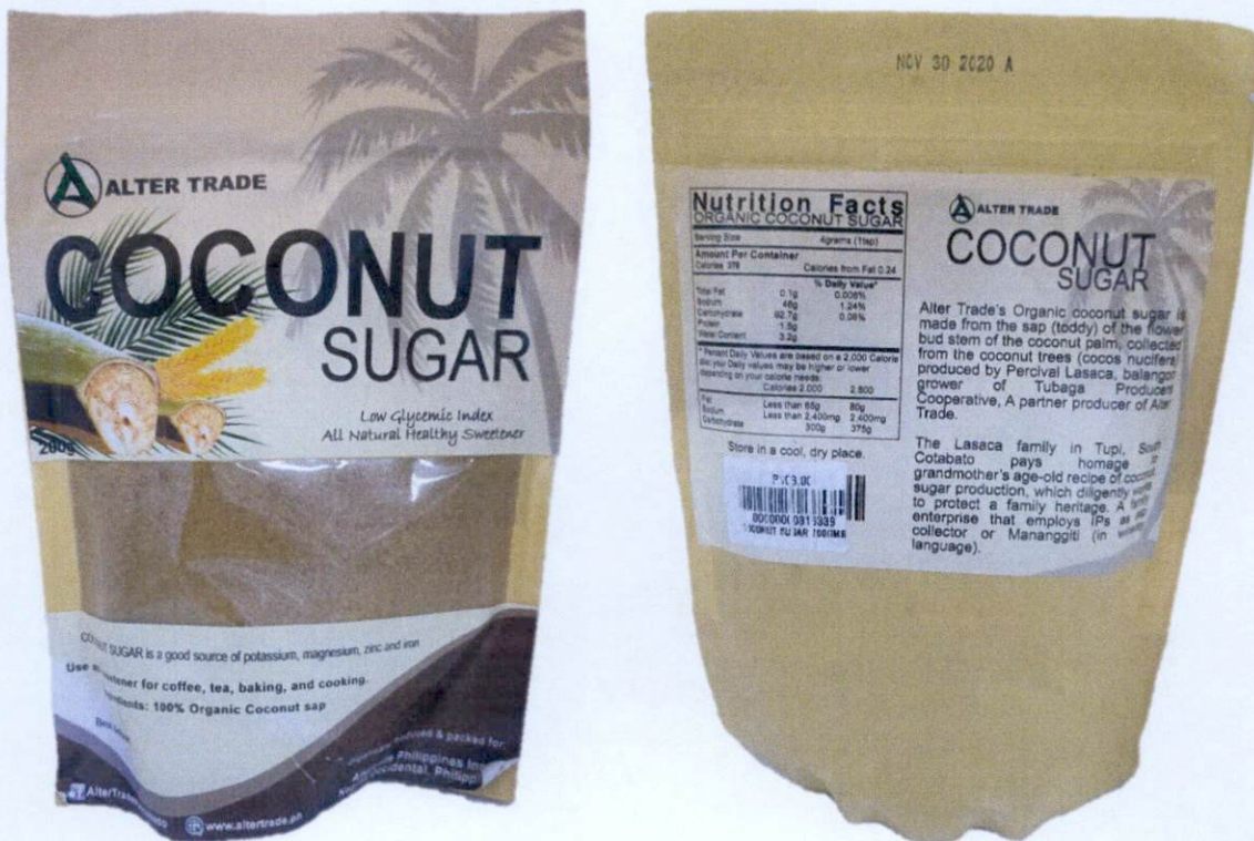
Figure 1. Unregistered ALTER TRADE Coconut Sugar

The Food and Drug Administration (FDA) warns all healthcare professionals and the general public NOT TO PURCHASE AND CONSUME the following unregistered food products: