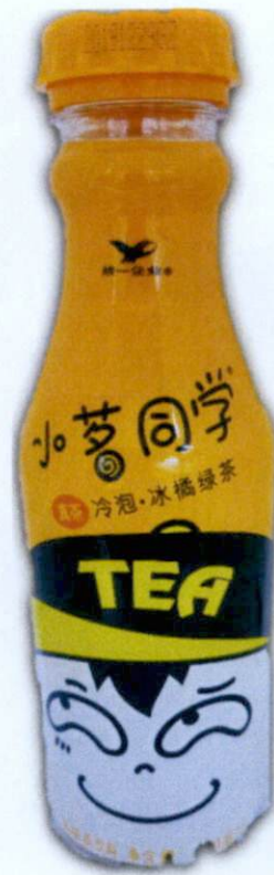
Figure 3. Unregistered Tea (Orange) 480ml (In Foreign Language)