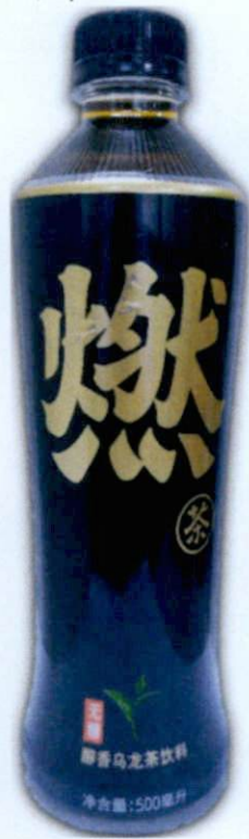
Figure 2. Unregistered Drink in Pet Bottle with Black and Gold Packaging (In Foreign Language)