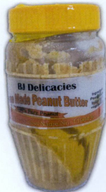
Figure 5. Unregistered BJ DELICACIES Home Made Peanut Butter