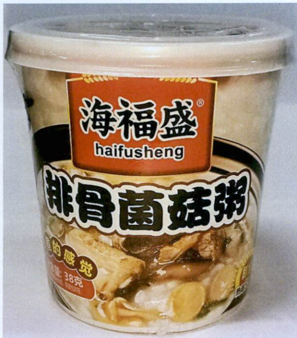
Figure 4. Unregistered HAIFUSHENG In Paper Cup Packaging with image of Pork Ribs in Porridge (In Foreign Language)