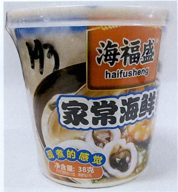
Figure 3. Unregistered HAIFUSHENG In Paper Cup Packaging with Image of Seafood in Porridge (In Foreign Language)