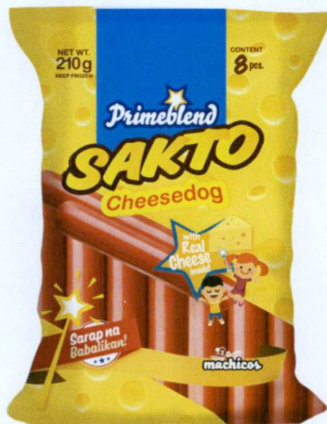
Figure 1. Unregistered PRIMEBLEND SAKTO Cheesedog

The Food and Drug Administration (FDA) warns all healthcare professionals and the general public NOT TO PURCHASE AND CONSUME the following unregistered food products: