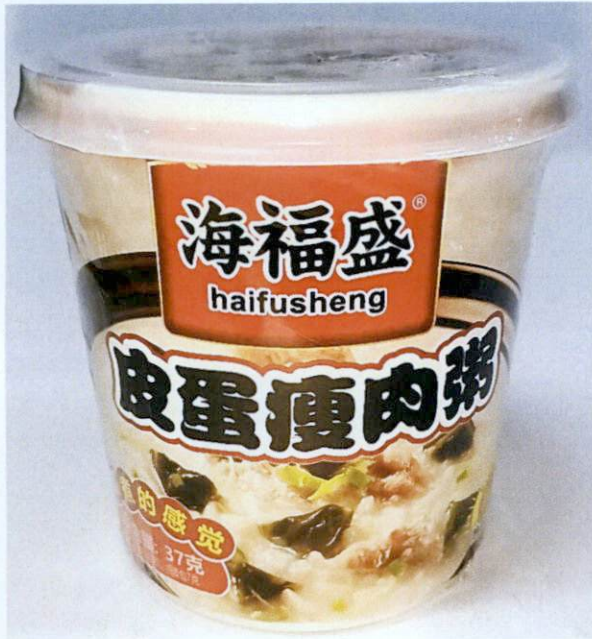
Figure 2. Unregistered HAIFUSHENG In Paper Cup Packaging with Image of Porridge (In Foreign Language)