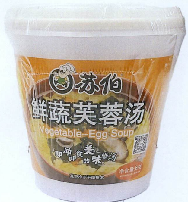
Figure 5. Unregistered Vegetable-Egg Soup In Plastic Cup Packaging With Orange Packaging (In Foreign Language)