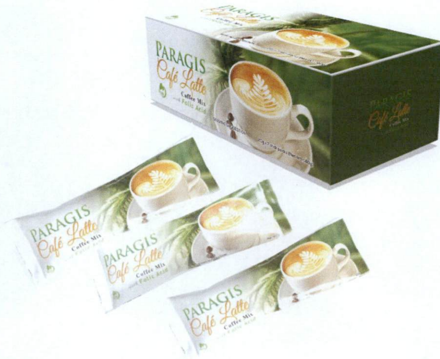
Figure 1. Approved Primary and Secondary labels of PARAGIS CAFÉ LATTE Coffee Mix with Folic Acid with registration number FR-4000007003752 valid until 21 October 2024.

The Food and Drug Administration (FDA) informs the public that the food product PARAGIS CAFÉ LATTE Coffee Mix with Folic Acid is now registered by the Market Authorization Holder, Premium Herbs Corp. in accordance to existing FDA rules and regulations.