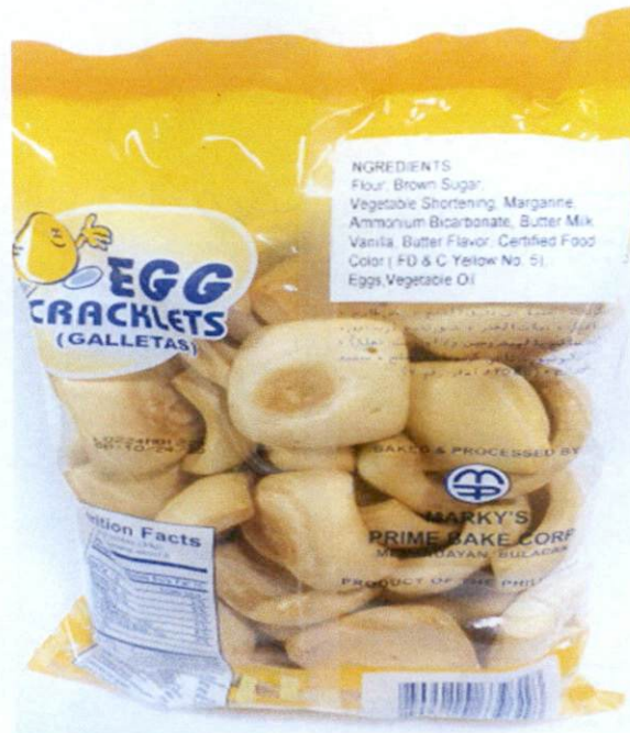
Figure 2. Information Display Panel of the Approved label of MARKY'S PRIME BAKE CORPORATION Egg Cracklets (Galletas) .

Accordingly, the list released in FDA Advisory No. 2020-058 is hereby updated to remove the aforementioned food product.