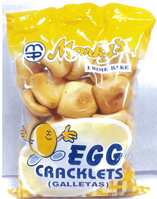
Figure 1. Principal Display Panel of the Approved label of MARKY'S PRIME BAKE CORPORATION Egg Cracklets (Galletas) with registration number FR No. 4000006227461 valid until 29 April 2025.

The Food and Drug Administration (FDA) informs the public that the food product MARKY'S PRIME BAKE CORPORATION Egg Cracklets (Galletas) has been registered by the Market Authorization Holder, MARKY'S PRIME BAKE CORPORATION, in accordance to existing FDA rules and regulations.