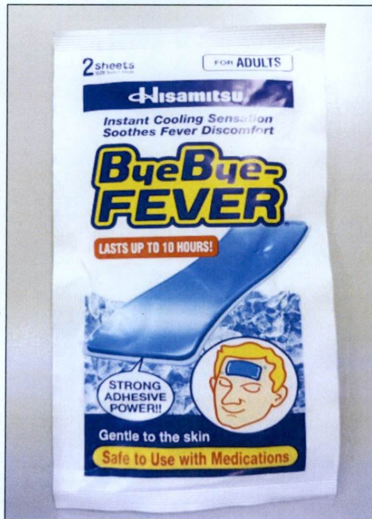
Figure 1. Unnotified Hisamitsu® Bye-bye Fever (For Adults)

The Food and Drug Administration (FDA) warns all healthcare professionals and the general public NOT TO PURCHASE AND USE the unnotified medical device products: