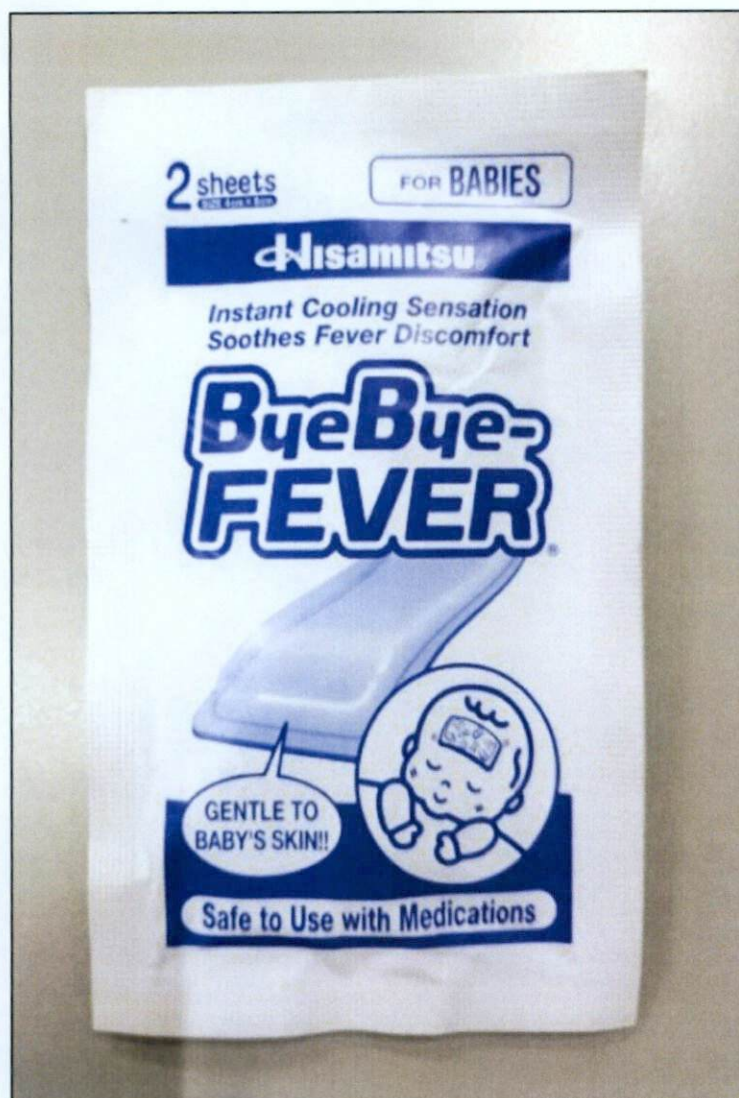
Figure 2. Unnotified Hisamitsu ® Bye-bye Fever (For Babies)

The FDA verified through post-marketing surveillance that the abovementioned medical device products are not notified and no corresponding Product Notification Certificates have been issued. Pursuant to the Republic Act No. 9711, otherwise known as the “Food and Drug Administration Act of 2009”, the manufacture, importation, exportation, sale, offering for sale, distribution, transfer, non-consumer use, promotion, advertising or sponsorship of health products without the proper authorization is prohibited.