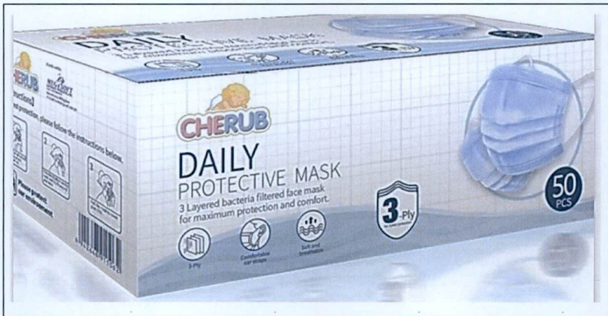
Figure 1. Unnotified Cherub Daily Protective Mask

The Food and Drug Administration (FDA) warns all healthcare professionals and the general public NOT TO PURCHASE AND USE the unnotified medical device product: