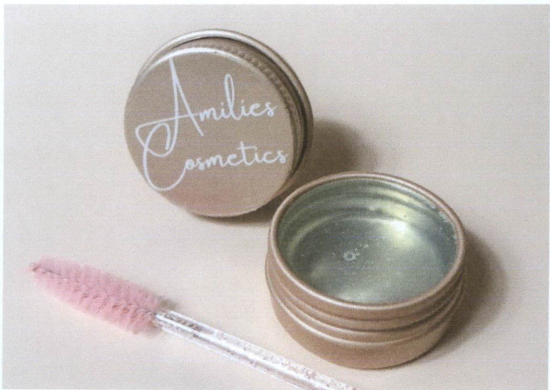
Figure 2. Unauthorized Product LIP SCRUB BY AMILIES COSMETICS