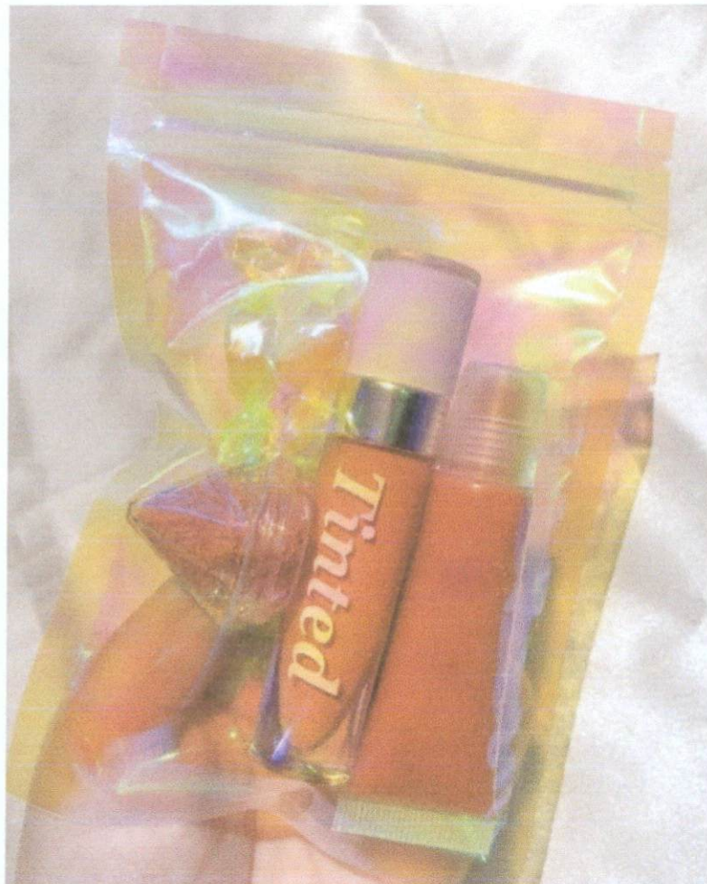
Figure 4. Unauthorized Product TINTED BY AMILIES COSMETICS