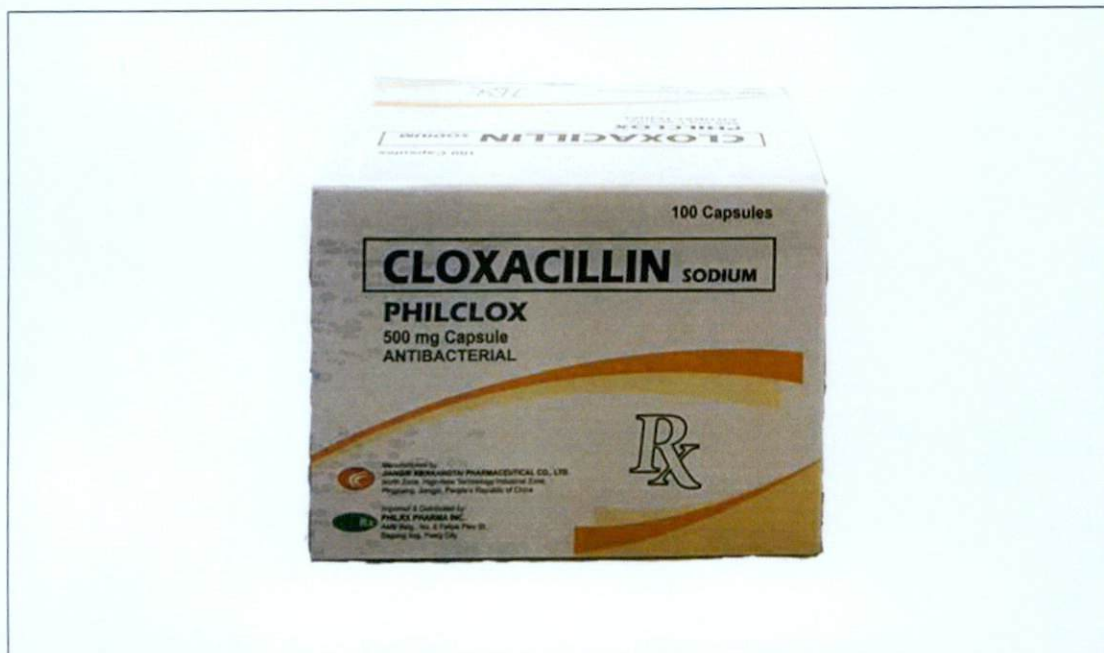
Figure 1. Cloxacillin (as sodium) 500 mg Capsule (Philclox) for recall