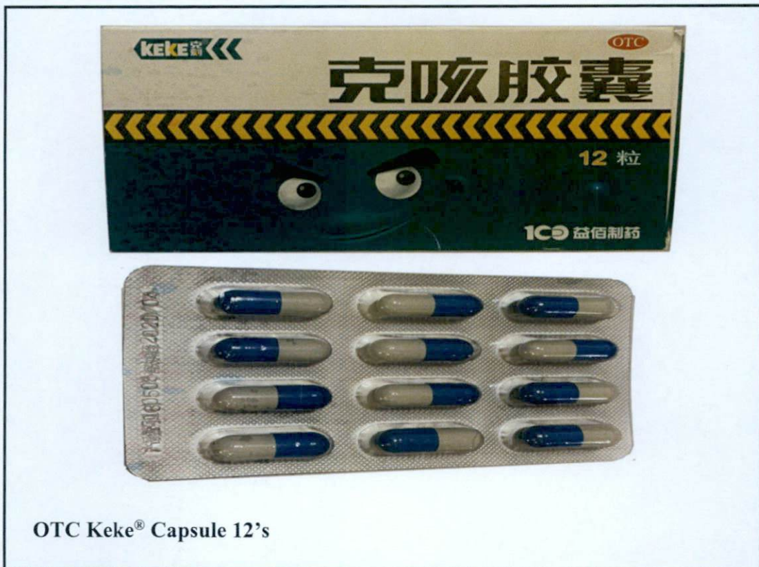
OTC Keke® Capsule 12's