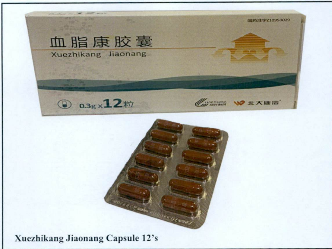
Xuezhikang Jiaonang Capsule 12's