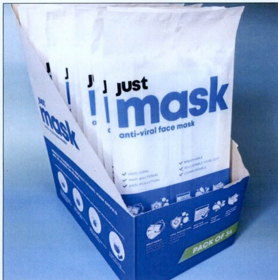
Figure 1. Unnotified Just Mask – Anti-Viral Face Mask

The Food and Drug Administration (FDA) warns all healthcare professionals and the general public NOT TO PURCHASE AND USE the unnotified medical device products: