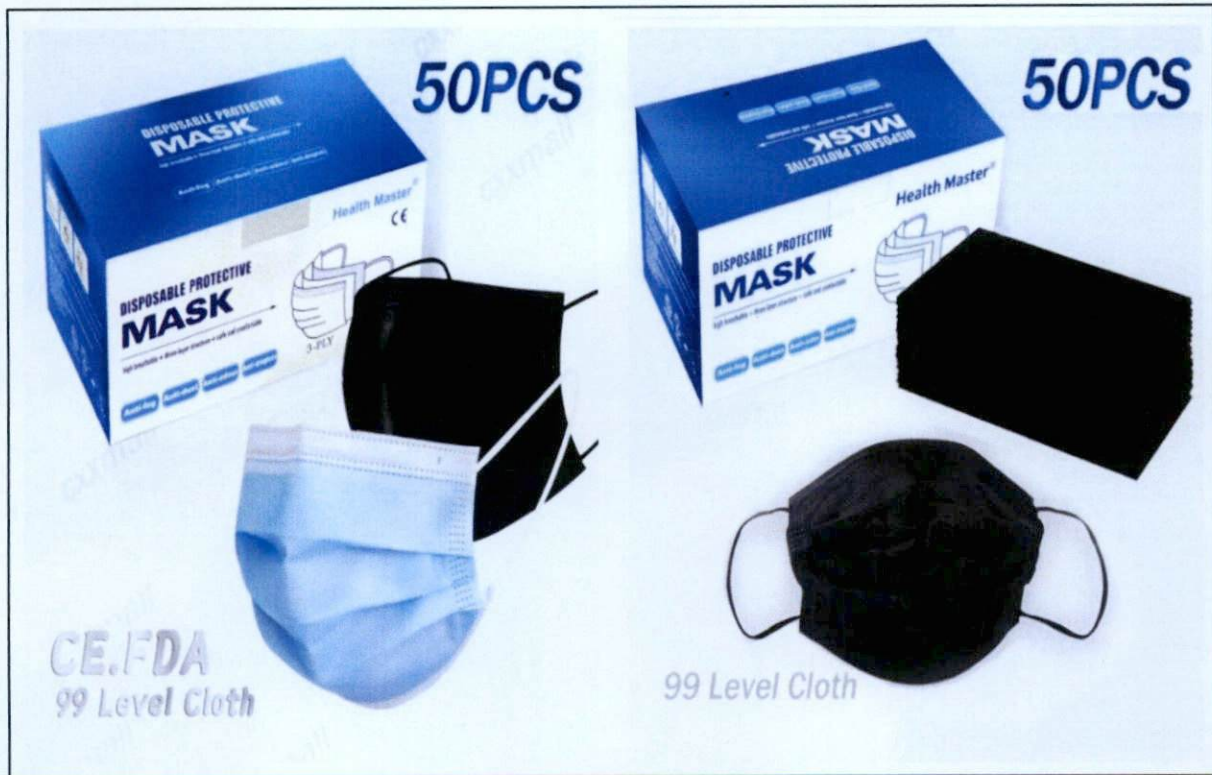
Figure 2. Unnotified Health Master – Disposable Protective Mask

The FDA verified through post-marketing surveillance that the above mentioned medical device products are not notified and no corresponding Product Notification Certificates have been issued. Pursuant to the Republic Act No. 9711, otherwise known as the “Food and Drug Administration Act of 2009”, the manufacture, importation, exportation, sale, offering for sale, distribution, transfer, non-consumer use, promotion, advertising or sponsorship of health products without the proper authorization is prohibited.