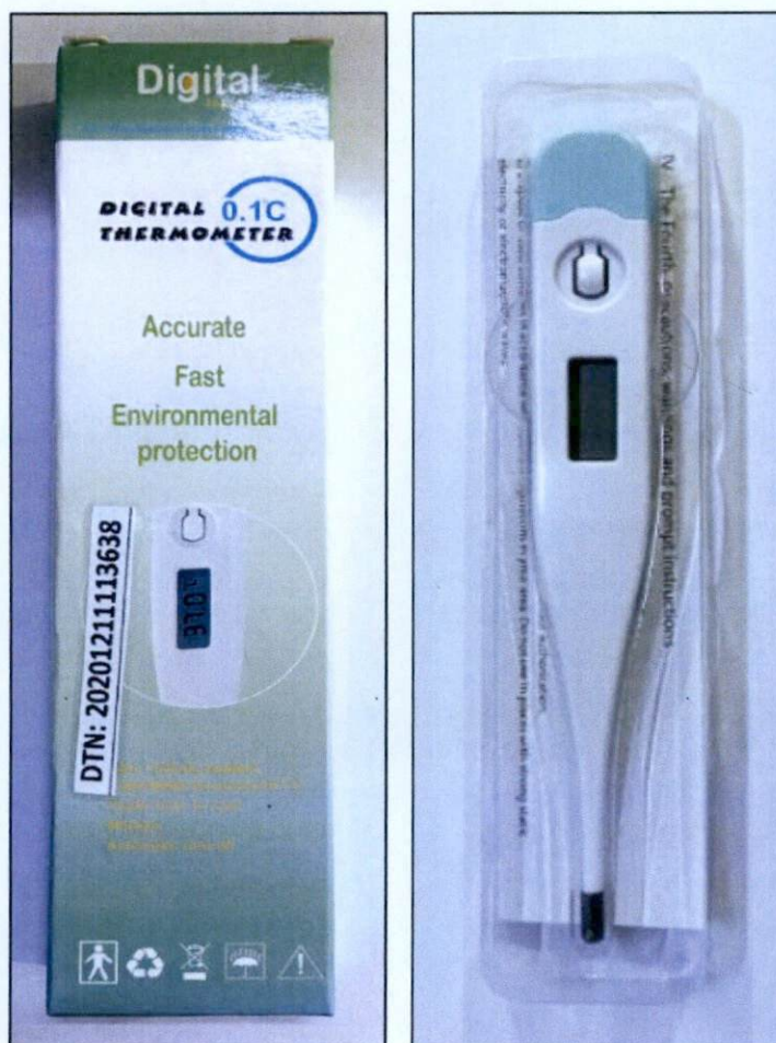
Figure 1. Unregistered Digital Thermometer 1.0°C

The Food and Drug Administration (FDA) warns all healthcare professionals and the general public NOT TO PURCHASE AND USE the unregistered medical device product: