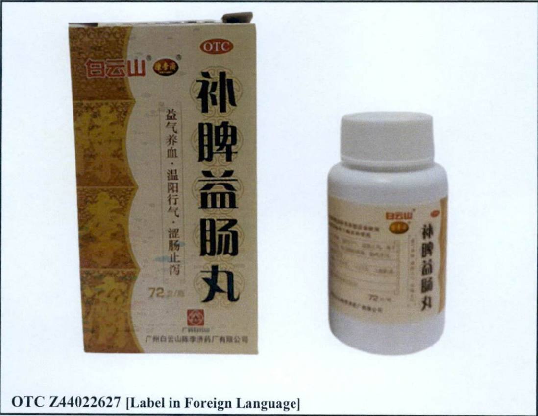
OTC Z44022627 [Label in Foreign Language]