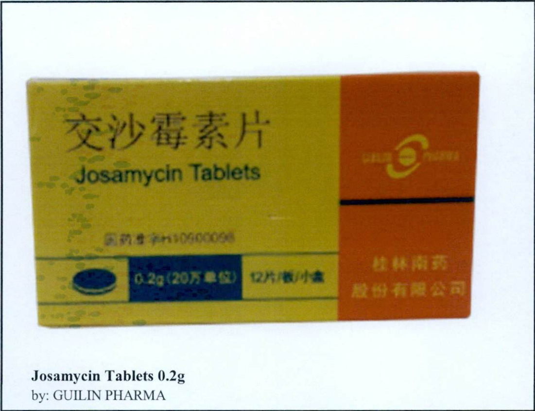
Josamycin Tablets 0.2g by: GUILIN PHARMA