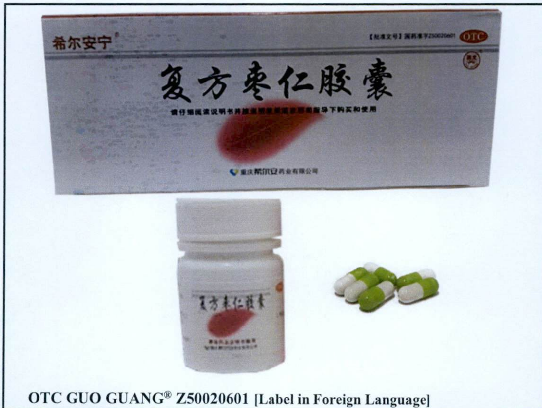
OTC GUO GUANG® Z50020601 [Label in Foreign Language]

The Food and Drug Administration (FDA) advises the public against the purchase and use of the following unregistered drug products: