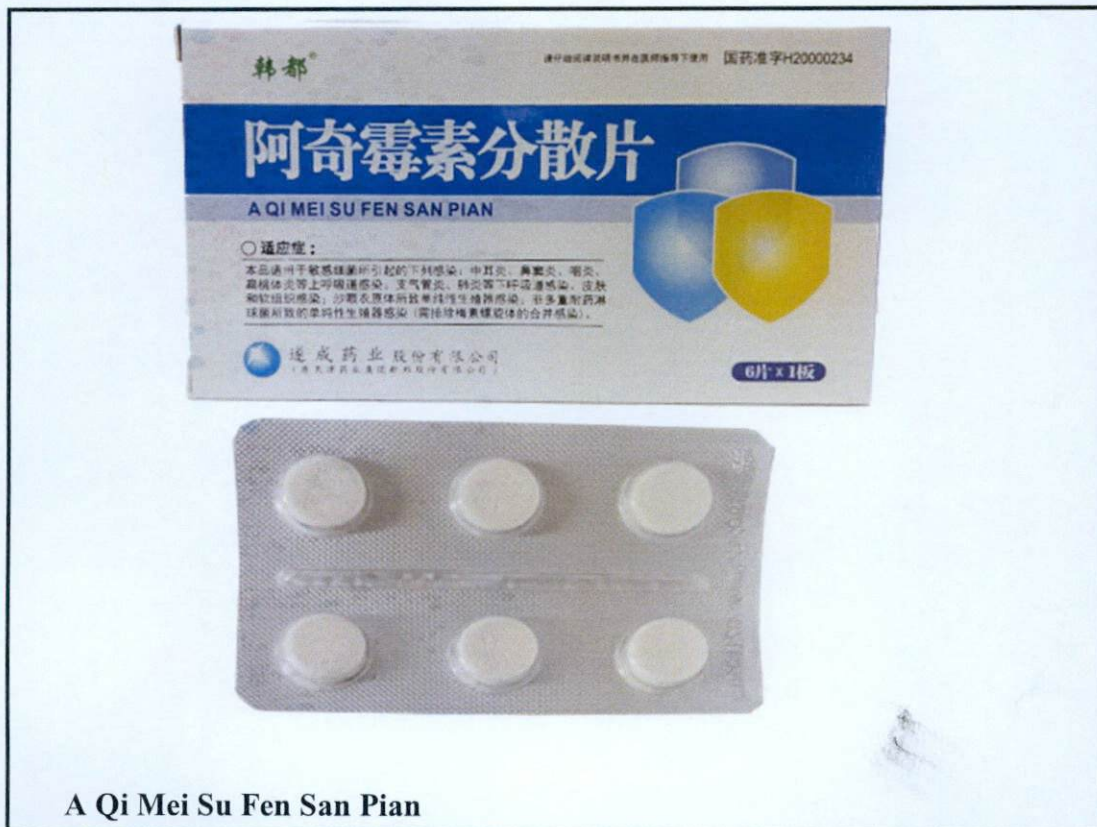
A Qi Mei Su Fen San Pian

The Food and Drug Administration (FDA) advises the public against the purchase and use of the following unregistered drug products: