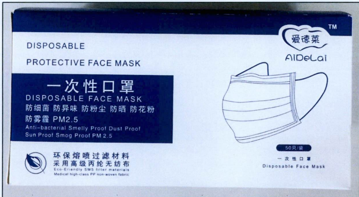
Figure 1. Unnotified AiDeLai™ Disposable Face Mask

The Food and Drug Administration (FDA) warns all healthcare professionals and the general public NOT TO PURCHASE AND USE the unnotified medical device product: