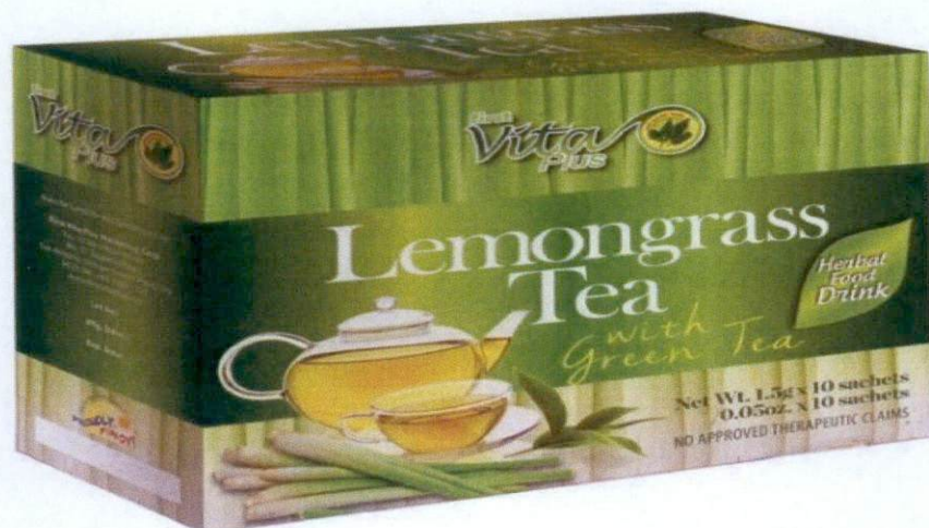
Figure 4. Unregistered FIRST VITA PLUS Lemon Grass Tea with Green Tea, Net Wt. 1.5g X 10 Sachets