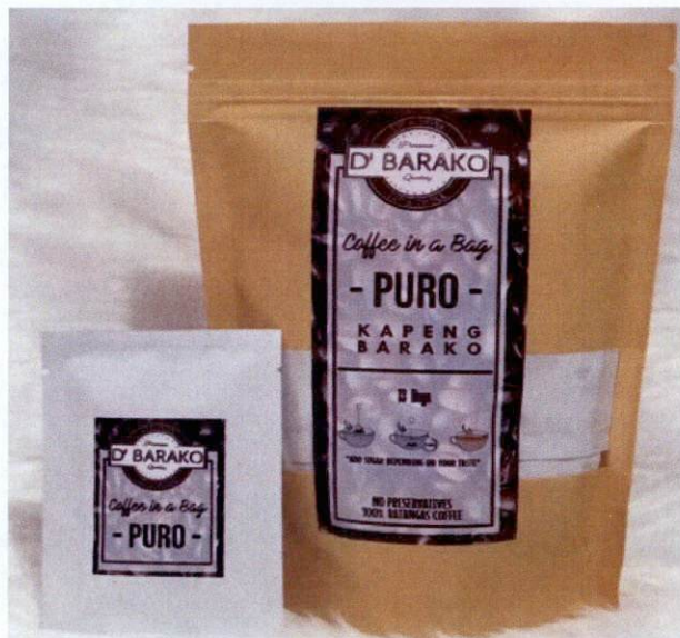
Figure 3. Unregistered D'BARAKO Coffee in a Bag Puro Kapeng Barako, 13 Bags