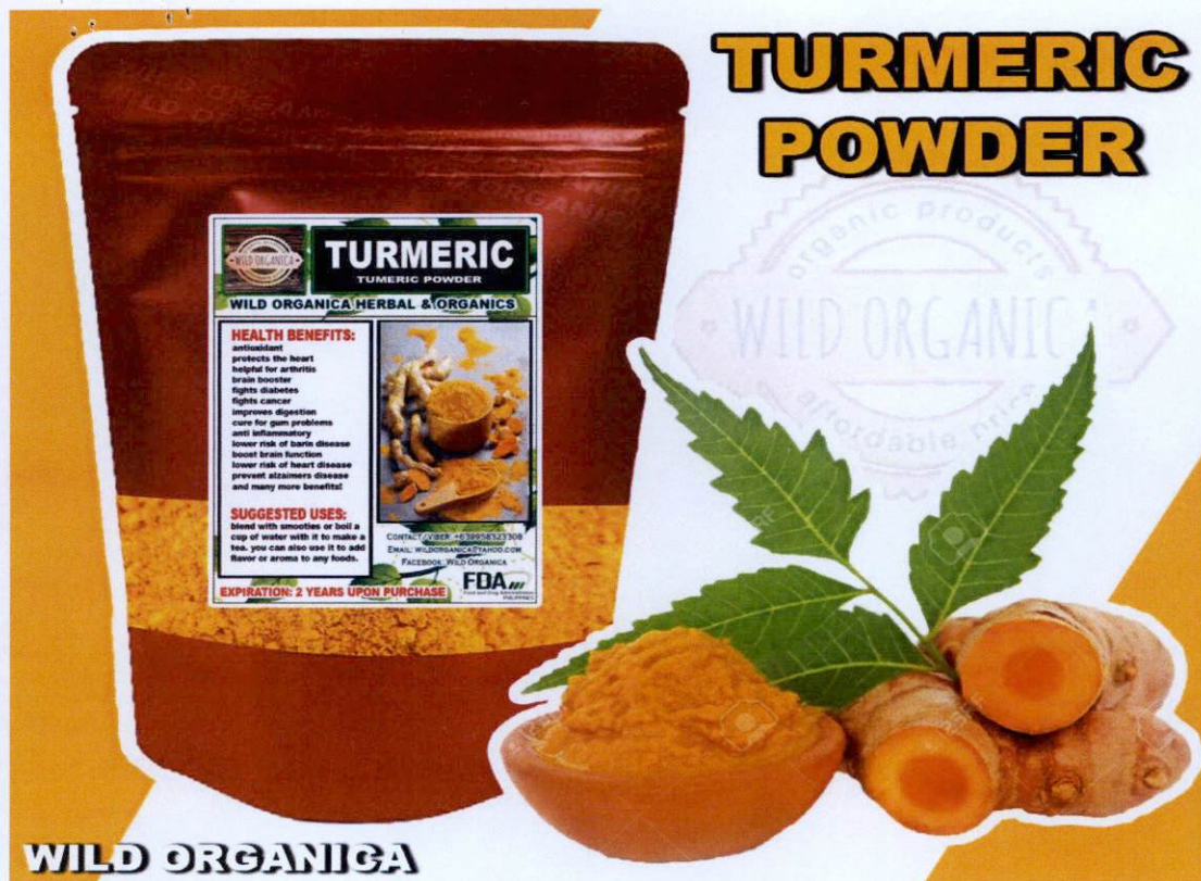
Figure 5. Unregistered WILD ORGANICA Turmeric Powder

The FDA verified through post-marketing surveillance that the abovementioned food products are not registered and no corresponding Certificates of Product Registration (CPR) have been issued. Pursuant to the Republic Act No. 9711, otherwise known as the “Food and Drug Administration Act of 2009”, the manufacture, importation, exportation, sale, offering for sale, distribution, transfer, non-consumer use, promotion, advertising or sponsorship of health products without the proper authorization is prohibited.