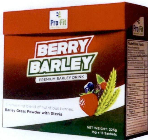
Figure 2. Unregistered PRO-FIT BERRY BARLEY Premium Barley Drink, Net Wt. 225g (15g X 15 Sachets)