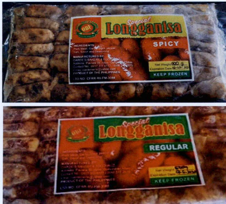
Figure 1. Unregistered OBF LONGGANISA DE GUINOBATAN Special Longganisa – Spicy | Special Longganisa - Regular

The Food and Drug Administration (FDA) warns all healthcare professionals and the general public NOT TO PURCHASE AND CONSUME the following unregistered food products: