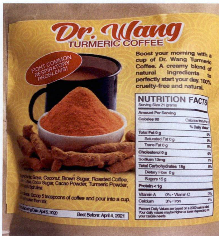
Figure 1. Unregistered DR. WANG Turmeric Coffee

The Food and Drug Administration (FDA) warns all healthcare professionals and the general public NOT TO PURCHASE AND CONSUME the following unregistered food products: