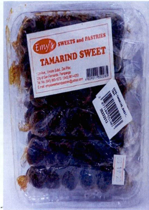
Figure 5. Unregistered EMY'S SWEETS AND PASTRIES Tamarind - Sweet