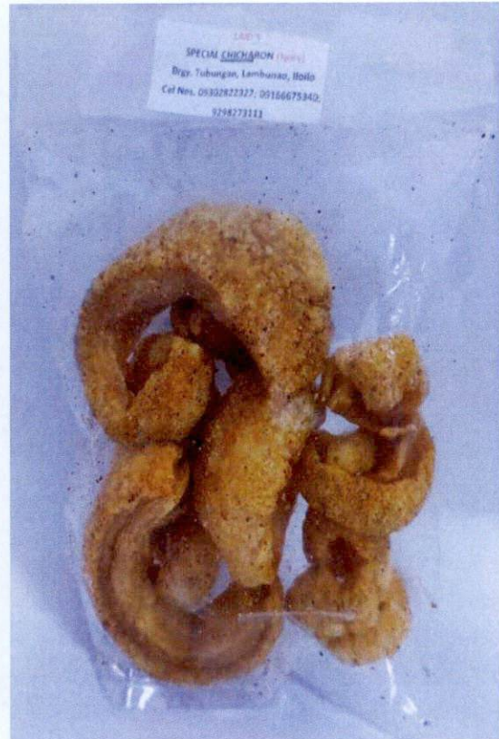
Figure 3. Unregistered LAID'S Special Chicharon – Spicy