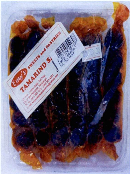
Figure 4. Unregistered EMY'S SWEETS AND PASTRIES Tamarind - Salted