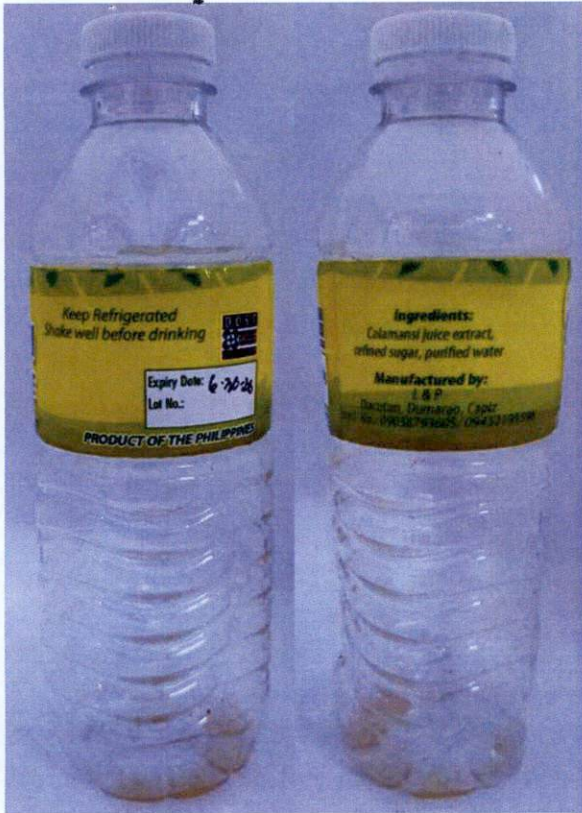
Figure 2. Unregistered L&P Calamansi Juice, Net Vol. 330ml