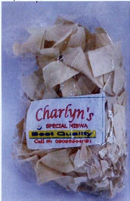
Figure 2. Unregistered CHARLYN'S Special Miswa