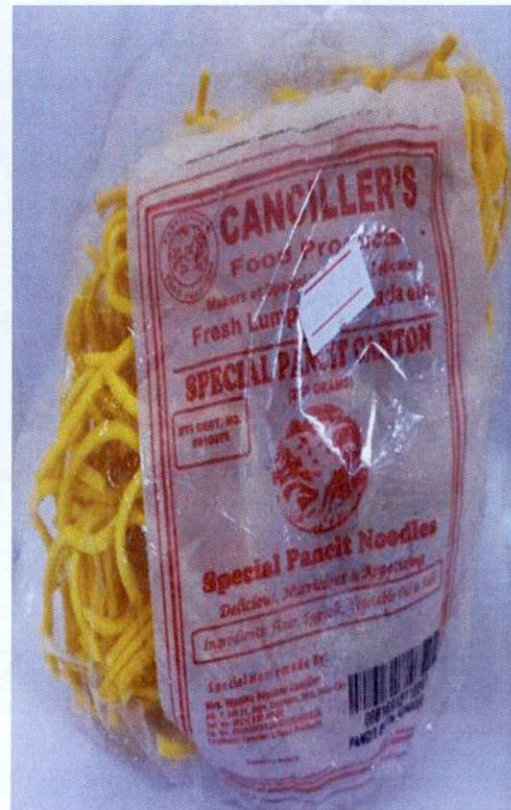
Figure 5. Unregistered CANCELLER'S FOOD PRODUCTS Special Pancit Canton, Net Wt. 250g