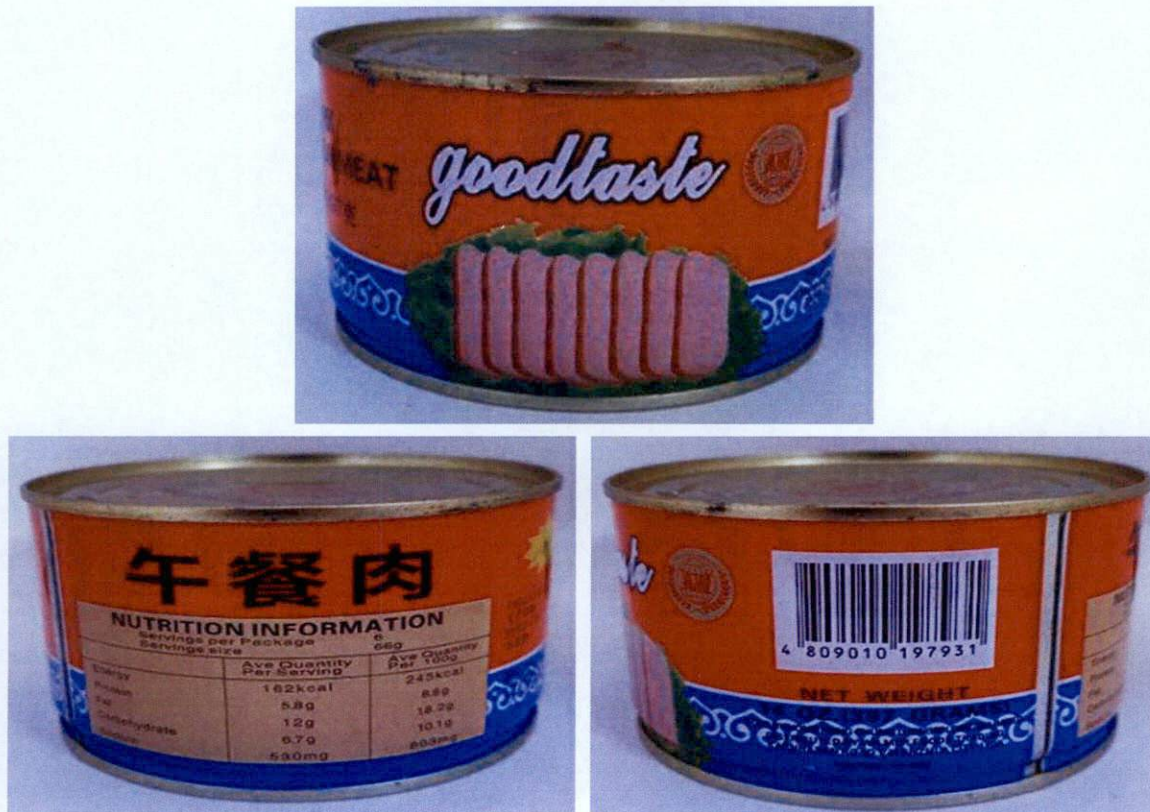
Figure 1. Unregistered GOODTASTE Pork Luncheon Meat, Net Wt. 397 grams (14 oz)

The Food and Drug Administration (FDA) warns all healthcare professionals and the general public NOT TO PURCHASE AND CONSUME the following unregistered food products: