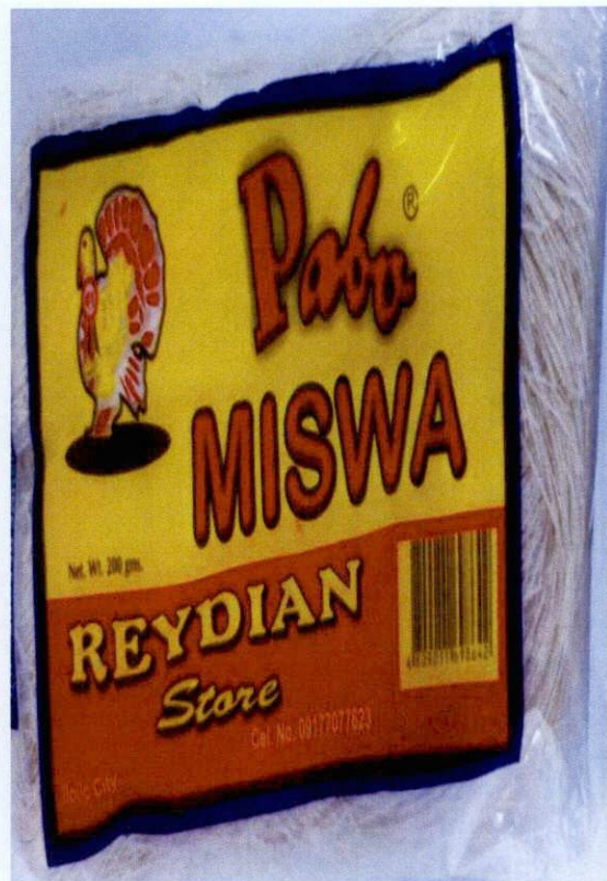
Figure 3. Unregistered PABO Miswa, Net Wt. 200g