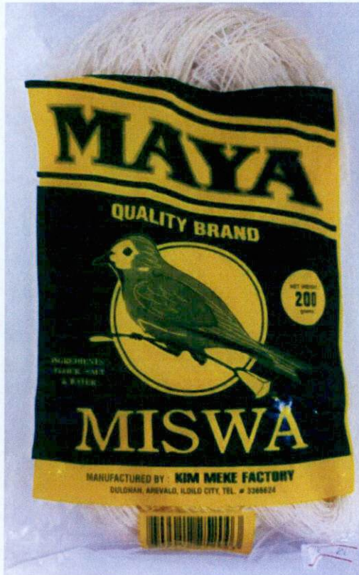
Figure 4. Unregistered MAYA Miswa, Net Wt. 200grams