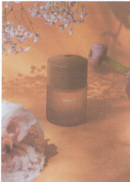
Figure 1. Unauthorized Product POUF! EVERYDAY BLOOM COLOGNE SPRAY

The Food and Drug Administration (FDA) warns the public from purchasing and using the following unauthorized cosmetic products. (Refer to the image below)