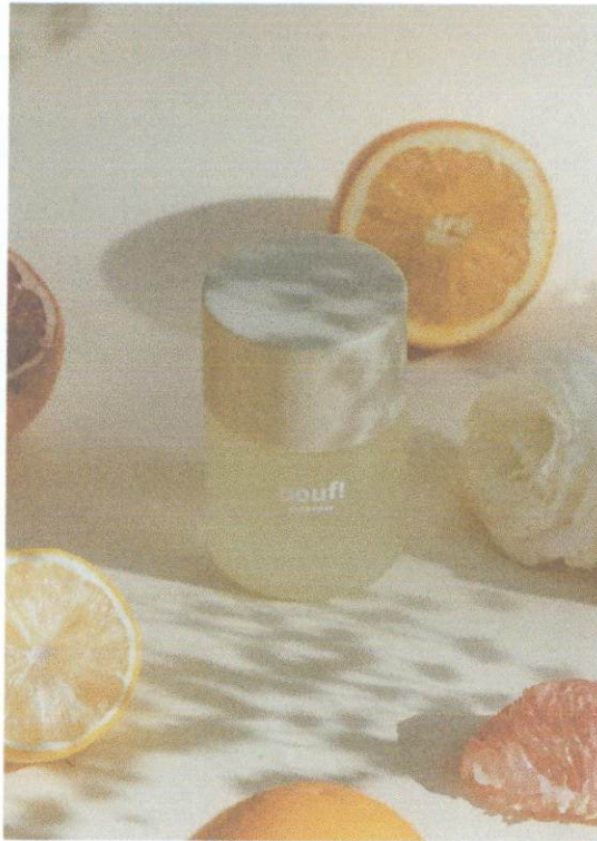
Figure 2. Unauthorized Product POUF! EVERYDAY RISE COLOGNE SPRAY