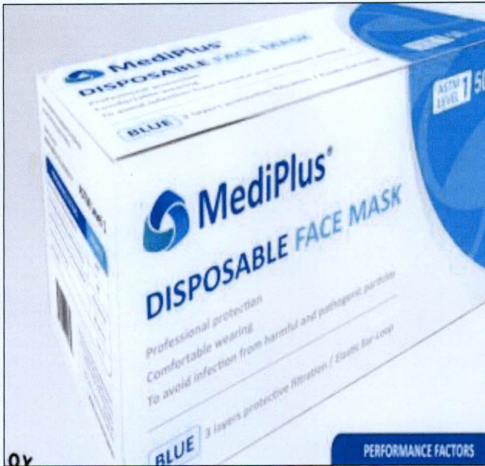
Figure 2. Unnotified Mediplus Disposable Face Mask