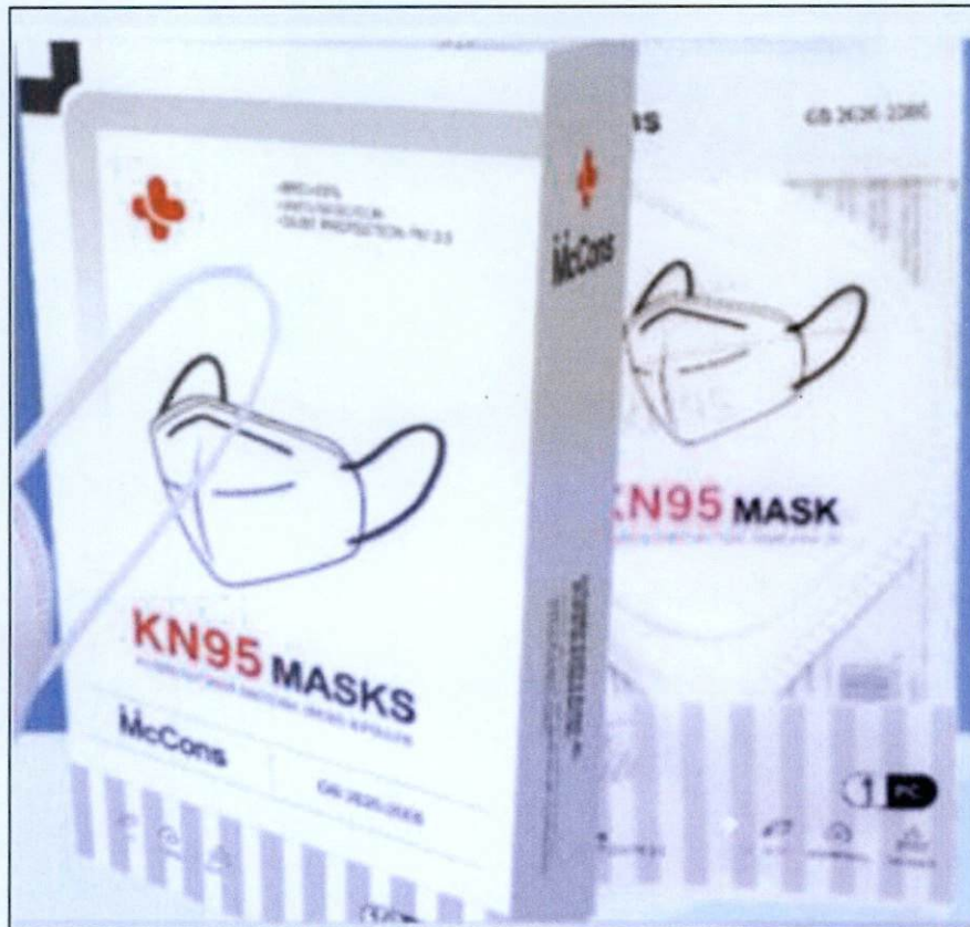
Figure 3. Unnotified McCons KN95 Mask