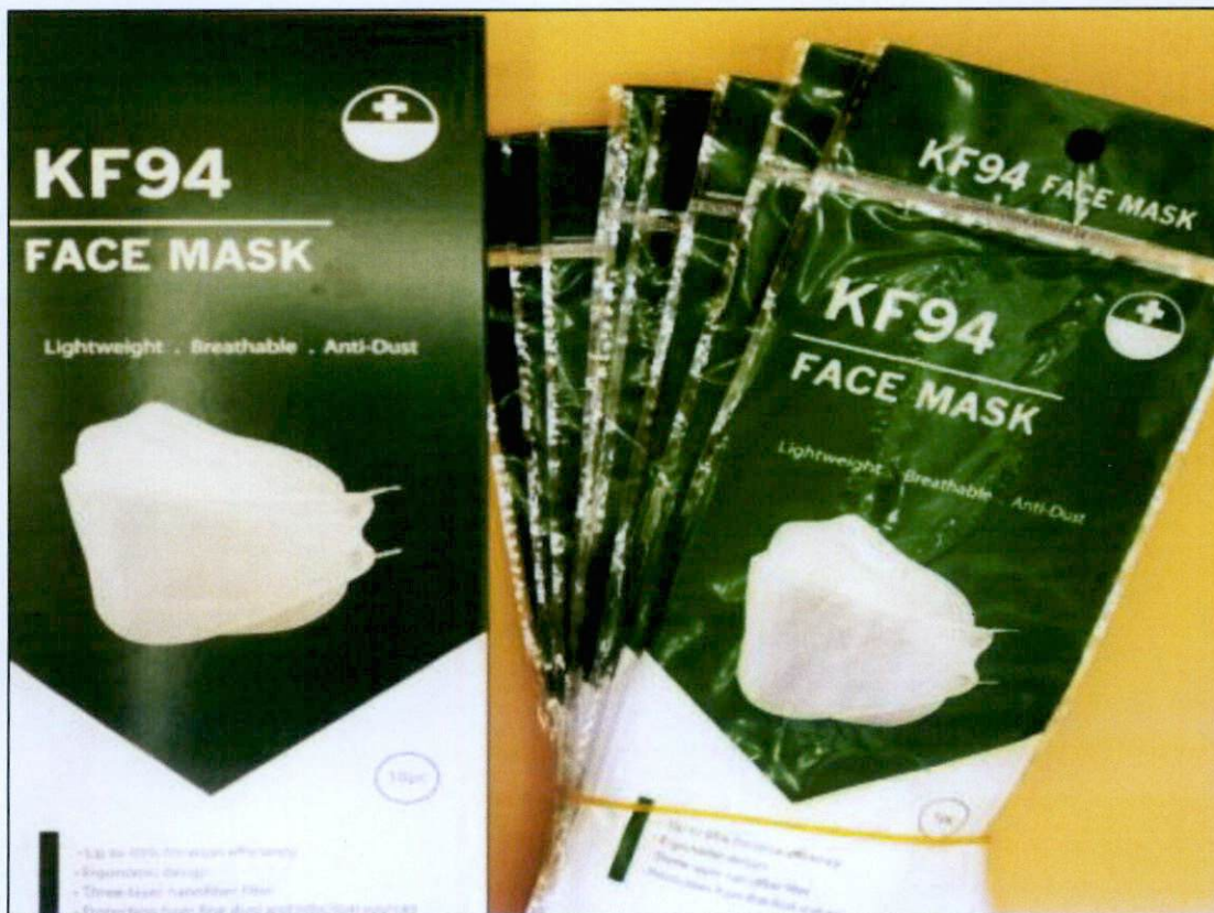
Figure 1. Unnotified KF94 Face Mask

The Food and Drug Administration (FDA) warns all healthcare professionals and the general public NOT TO PURCHASE AND USE the unnotified medical device products: