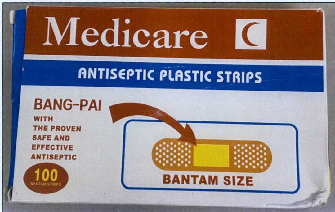
Figure 1. Unnotified Medicare Antiseptic Plastic Strips

The Food and Drug Administration (FDA) warns all healthcare professionals and the general public NOT TO PURCHASE AND USE the unnotified medical device product: