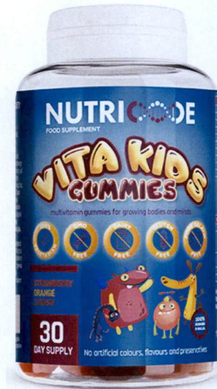
Figure 3. Unregistered NUTRICODE FOOD SUPPLEMENT Vita Kids Gummies – Strawberry, Orange, Cherry, 30 Day Supply