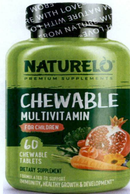
Figure 1. Unregistered NATURELO PREMIUM SUPPLEMENTS Chewable Multivitamin for Children Dietary Supplement, 60 Chewable Tablets

The Food and Drug Administration (FDA) warns all healthcare professionals and the general public NOT TO PURCHASE AND CONSUME the following unregistered food supplements: