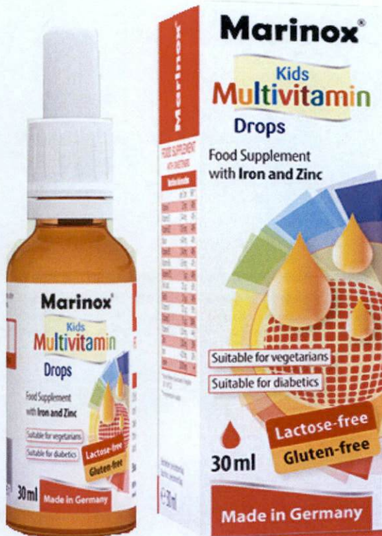
Figure 4. Unregistered MARINOX Kids Multivitamin Drops with Iron and Zinc Food Supplement, 30ml