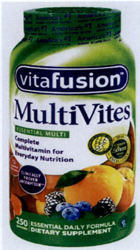
Figure 2. Unregistered VITAFUSION Multivites Essential Daily Formula Dietary Supplement, 250 Gummies