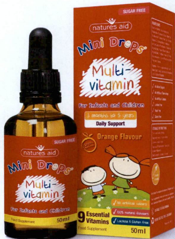
Figure 5. Unregistered NATURES AID Mini Drops Multivitamins Food Supplement – Sugar Free, 50ml