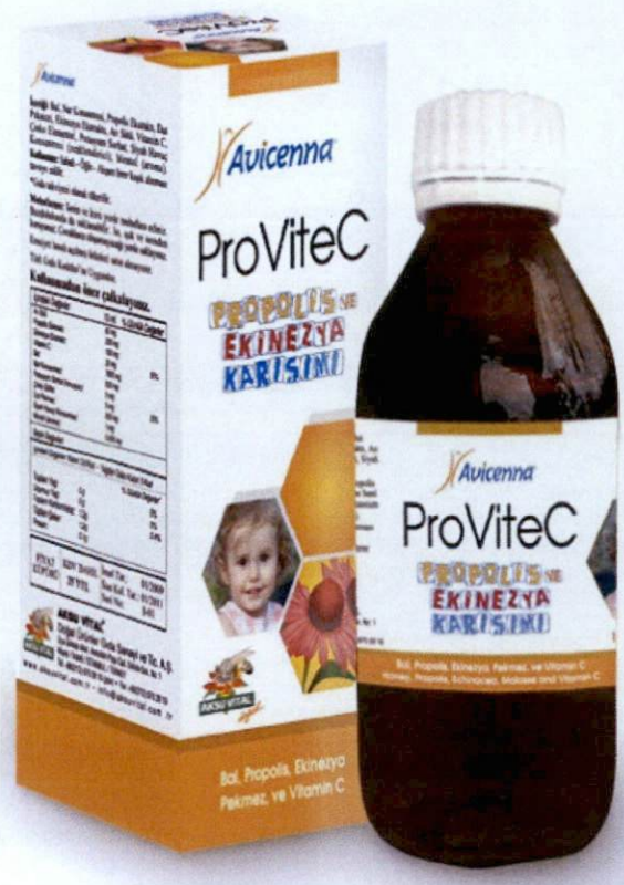
Figure 5. Unregistered AVICENNA PROVITEC Propolis Ekinezya Karisimi , 150ml