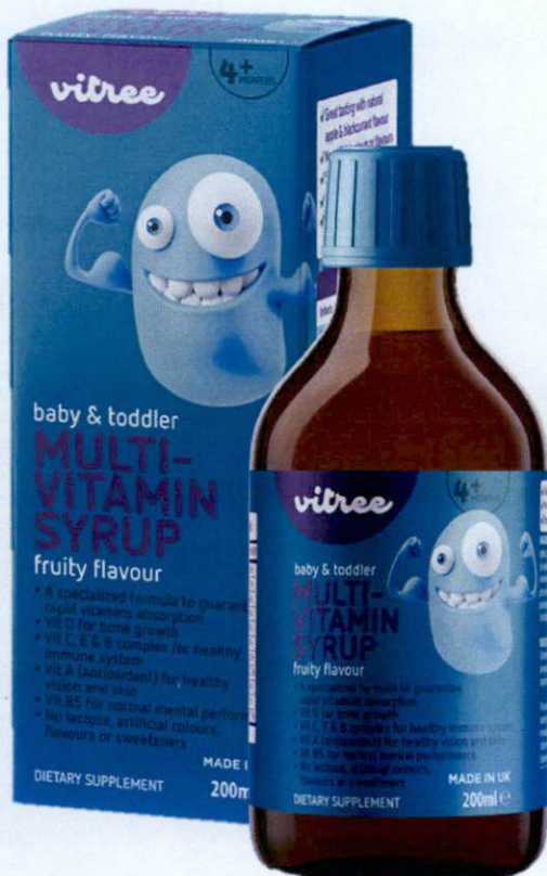
Figure 4. Unregistered VITREE Baby & Toddler Multi Vitamin Syrup Dietary Supplement – Fruity Flavour, 200ml