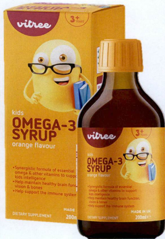
Figure 3. Unregistered VITREE Omega-3 Syrup – Orange Flavour Dietary Supplement, 200ml