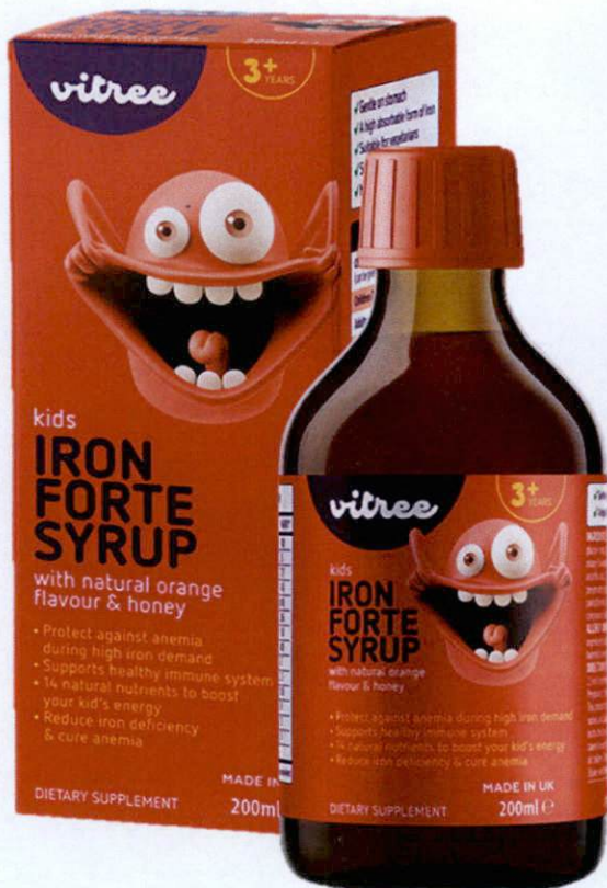
Figure 2. Unregistered VITREE Kids Iron Forte Syrup Dietary Supplement, 200ml