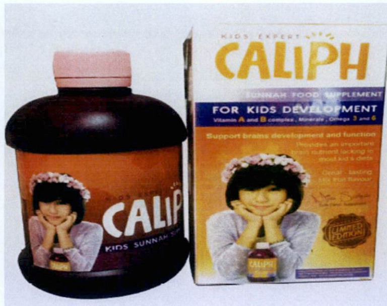
Figure 1. Unregistered KIDS EXPERT CALIPH Sunnah Food Supplement Vitamin A and Vitamin B Complex + Minerals + Omega 3 and 6

The Food and Drug Administration (FDA) warns all healthcare professionals and the general public NOT TO PURCHASE AND CONSUME the following unregistered food supplements: