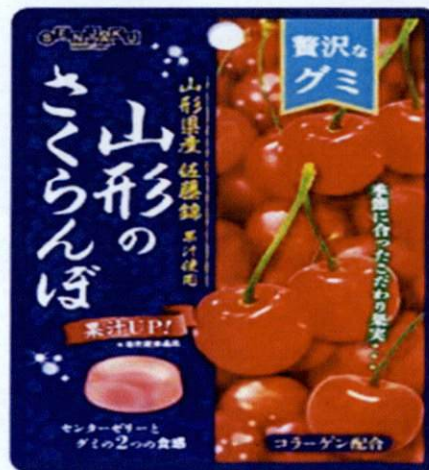
Figure 1. Unregistered Candy like in Blue Colored Packaging with Image of Cherries (Labels are in foreign characters)

The Food and Drug Administration (FDA) warns all healthcare professionals and the general public NOT TO PURCHASE AND CONSUME the following unregistered food products: