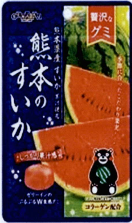
Figure 2. Unregistered Candy like in Blue Colored Packaging with Image of Sliced Watermelon (Labels are in foreign characters)