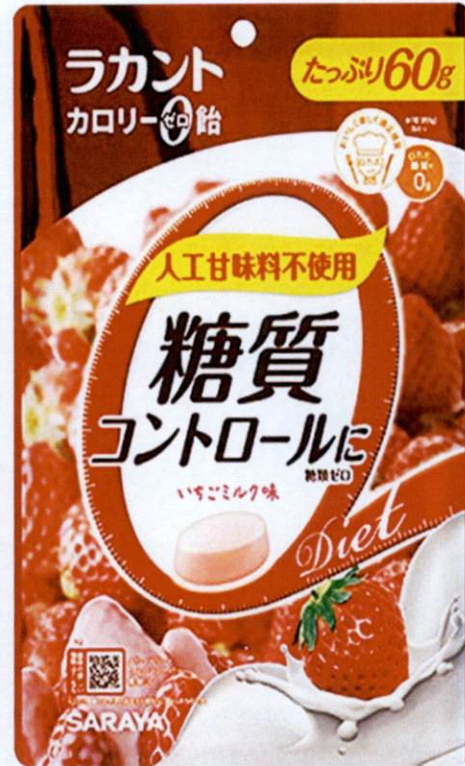
Figure 3. Unregistered Candy like in Red Colored Packaging with Image of Strawberries (Labels are in foreign characters)