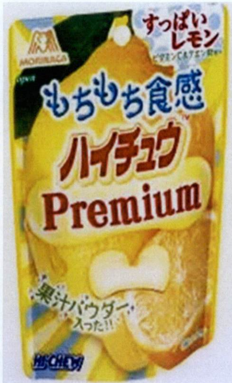
Figure 4. Unregistered MORINAGA Premium Hi-Chew - in Yellow Packaging with Image of Lemon (Labels are in foreign characters)