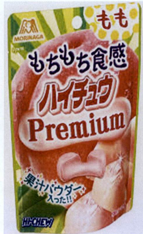
Figure 5. Unregistered MORINAGA Premium Hi-Chew -in Light Green Packaging with Image of Peach (Labels are in foreign characters)