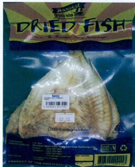
Figure 5. Unregistered HARVEST FROM THE SEA DRIED FISH - CS RDV Katambak, 100g