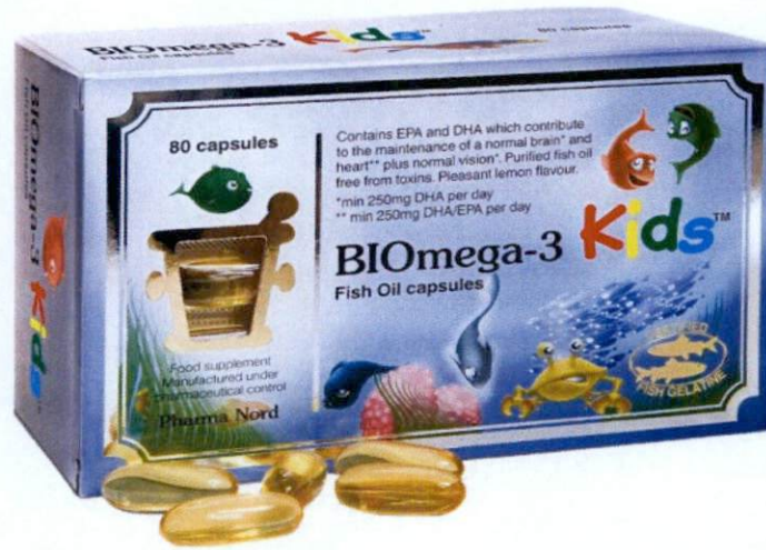
Figure 3. Unregistered BIOMEGA-3 KIDS Fish Oil Capsules – Pleasant Lemon Flavour, 80 Capsules