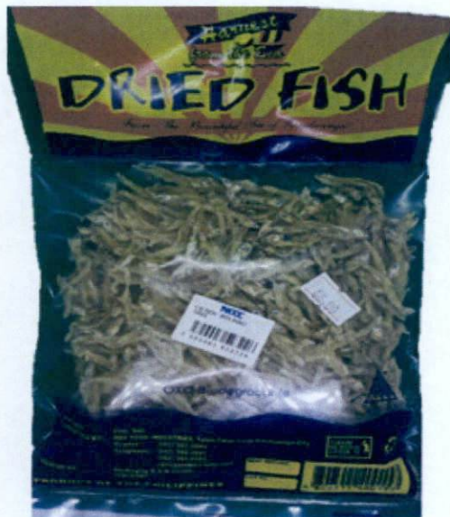
Figure 4. Unregistered HARVEST FROM THE SEA DRIED FISH - CS RDV Bolinao, 100g