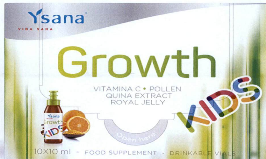
Figure 1. Unregistered YSANA VIDA SANA Growth Kids with Vitamin C + Pollen +Quina Extract Royal Jelly Food Supplement, 10X10ml

The Food and Drug Administration (FDA) warns all healthcare professionals and the general public NOT TO PURCHASE AND CONSUME the following unregistered food supplements and food products: