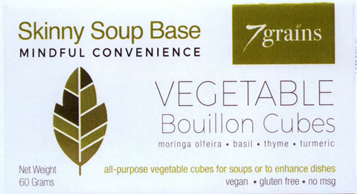
Figure 1. Approved label of 7GRAINS Skinny Soup Base Vegetable Bouillon Cubes, FR-4000004912220 issued on 19 November 2019 valid until 25 November 2024

The Food and Drug Administration (FDA) informs the public that the food product 7GRAINS Skinny Soup Base Vegetable Bouillon Cubes has been registered by the Market Authorization Holder (MAH) 7Grains Company in accordance to existing FDA rules and regulations.