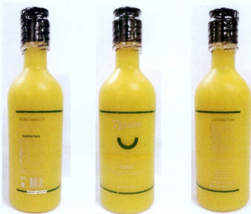
Figure 1. Approved label of 7GRAINS Lemonsito / Calamansi Puree, FR-4000005494565 issued on 22 July 2020 valid until 13 March 2025

The Food and Drug Administration (FDA) informs the public that the food product 7GRAINS Lemonsito / Calamansi Puree has been registered by the Market Authorization Holder (MAH) 7Grains Company in accordance to existing FDA rules and regulations.