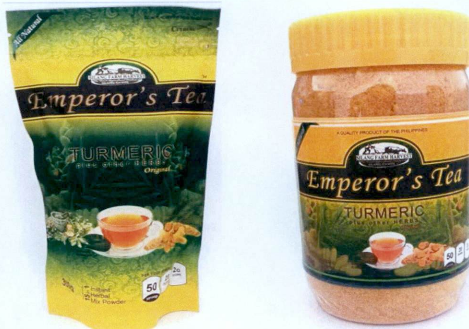
Figure 1. Approved label of EMPEROR'S 15-in-1 Turmeric Tea, FR-400005525085 issued on 11 March 2020 valid until 11 March 2022

The Food and Drug Administration (FDA) informs the public that the food product EMPEROR'S 15-in-1 Turmeric Tea has been registered by the Market Authorization Holder (MAH) Silang Farm Harvest Enterprise in accordance to existing FDA rules and regulations.